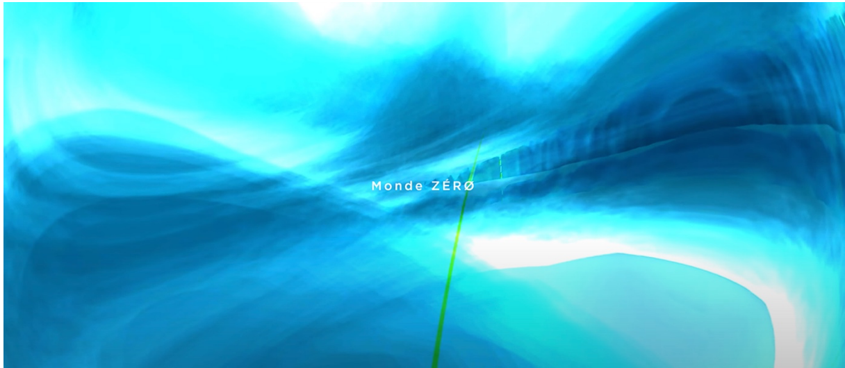
Ill.01: Marc Veyrat / Société i Matériel, i-REAL World ZÉRØ_01 , 2024 https://youtu.be/04jcQpOr8Og