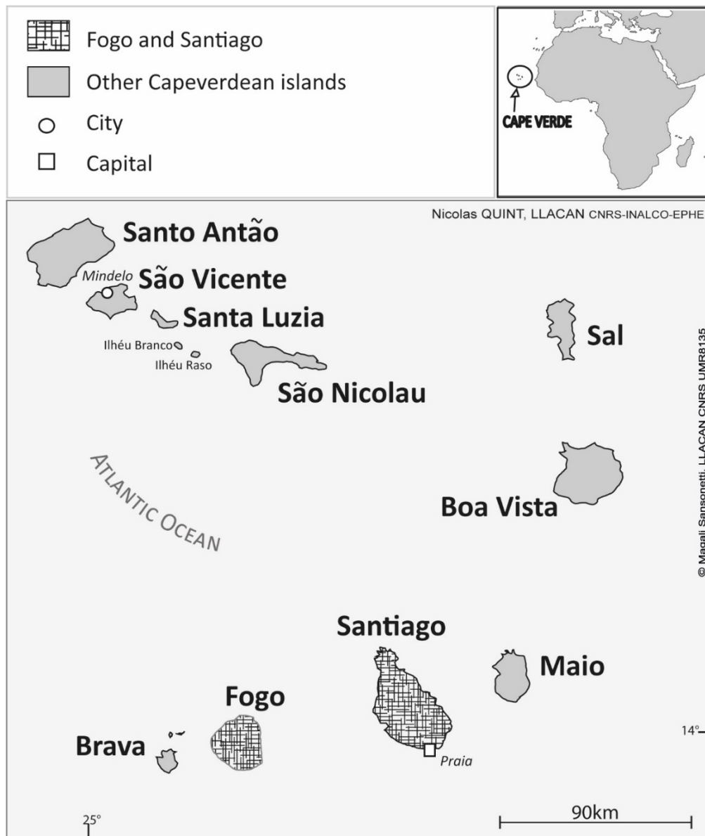
Map 2: Insular (Capeverdean) Upper Guinea Creoles.

The degree of mutual understanding between the different UGCs is variable: speakers of any two continental varieties can easily chat with each other without any previous contact, and the same is true for speakers of the various ABC varieties. The insular branch shows a higher degree of internal differentiation, in particular between Barlavento and Sotavento: users of rural varieties of each of these subbranches may find it difficult to fully understand each other. Between speakers of different UGC branches, a basic understanding is always possible due to the structural and lexical features shared by all UGCs. However, the linguistic distance between each of the three branches is such that speakers must usually actively learn some elements of each other's varieties before being able to communicate effectively. In other words,