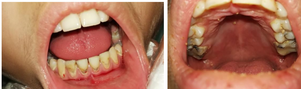
FIGURE 2 Intraoral view showing multiple cervical caries, large restorations over the permanent molars and remnants of food debris due to reduced washing action of saliva.