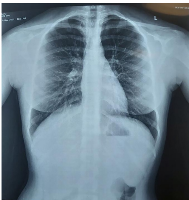
FIGURE 5 Chest x-ray showing no signs of hilar lymphadenopathy.

of the eyes, lymph nodes, and lungs. 5 Our case fits into the second category with the exception of lung involvement.