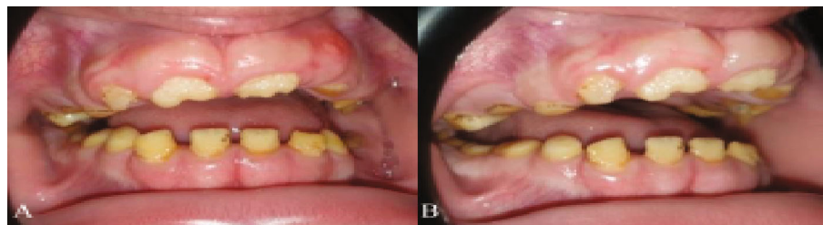
FIGURE 3: Case 3. (A, B) Front and lateral view photographs of the 9-year-old boy showing moderate gingival fibromatosis.