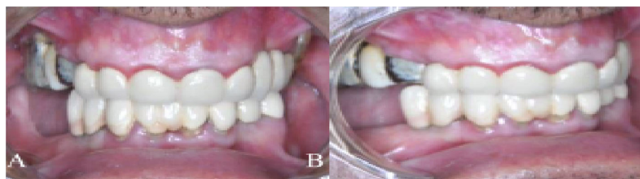
FIGURE 4: Case 4. (A, B) Front and lateral view photographs of the 48-year-old father showing a mild-to-moderate gingival fibromatosis with bridge prosthesis.

was observed (Figure 4). The patient had no complains and was not seeking any treatment.