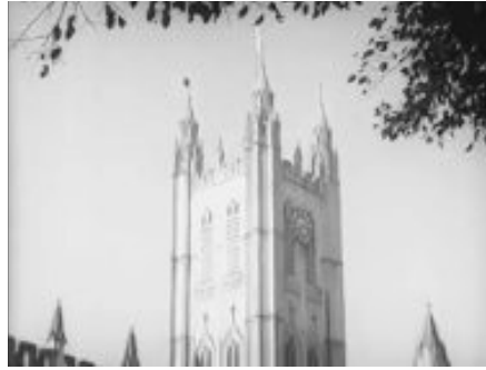
Fig. 4, 5, 6: A close-up of a statue of the Goddess Kali slowly dissolves into a visual of a church