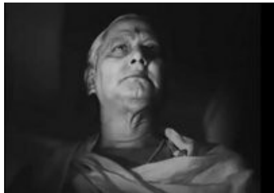
Fig. 3: Krishnendu's father is pictured in a low angle shot that emphasises markers of religion and caste supremacy, notably his janeu or sacred white thread that is worn across his left shoulder

highlighted through multiple imposing low angle shots that highlight his janeu , a sacred white thread that is meant to be worn across the shoulder exclusively by men from Brahmin caste groups and a few other non-Brahmin dominant caste groups. As for Krishnendu (the secular Brahmin), the manner in which he is styled throughout the film makes it impossible to ascertain if he wears a janeu as well. Krishnendu's father is also shown to espouse the age-old superstition that crossing the seas will lead to a loss of one's caste, which is why several Brahmins did not travel abroad in the past due to the fear of being excommunicated. His attitude is in opposition to Krishnendu's worldview as well as his comparatively liberal wife's wish for their son Krishnendu to work as a doctor abroad. Also, unlike Brabantio who expressed displeasure at his daughter Desdemona's marriage to Othello in Shakespeare's text, it is Krishnendu's father who is against his son's marriage to Rina to avoid the loss of his caste and excommunication, and even emotionally blackmails Rina into rejecting Krishnendu.