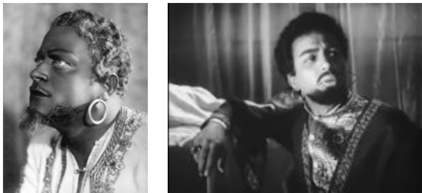
Fig. 1: Russian tenor Arnold Azrikan in Verdi's Otello (Wikimedia Commons), Fig. 2: The Indian actor Uttam Kumar as Krishnendu Mukherjee in his 'Othello get-up' in Saptapadi (all images from the film are screenshots taken from: https://youtu.be/CxmknJbzVMM )

singer Arnold Azrikan was styled to play Othello from 1939 to 1968 in various performances of Giuseppe Verdi's opera entitled Otello .