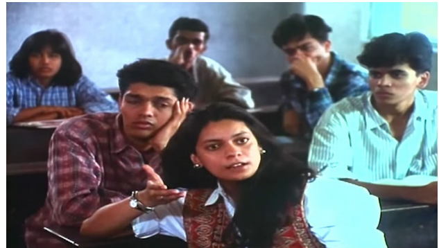
Figures 3–6: Amar convinces his students that Othello committed a premeditated murder, insisting that 'Othellos are killing Desdemonas' even today.

However, Amar learns of Mansi's infidelity towards the end of the film, following a mousetrap device of sorts used by her along with Amita, who is one of Amar's students. When Amita initially catches Mansi red-handed and confronts her, Mansi breaks down and confides in Amita. Mansi weeps in her arms, turning Amita into an Emilia-like figure, giving the spectator a visual rendition of the Willow song. Soon after, Mansi convinces Amita to narrate a fictionalized, anonymous story of a housewife prostituting herself in order to discern his reaction. Amita does so during a get-together in Amar and Mansi's home, in the presence of Mansi as well as many of Amar's students. This is where Amar's anti-Othello stand comes to the forefront; he insists that all