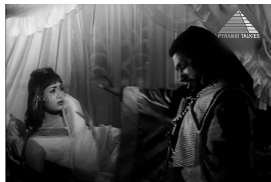
Figures 1 and 2: The Desdemona and Othello characters in Saptapadi and Ratha Thilagam, respectively, just before the former is killed by the latter. (All images have been sourced from the films referenced in the bibliography)

On the contrary, Izzat and Aastha feature ‘upper’ and ‘lower’ caste/class male and female characters who explicitly question the Othello character’s judgements and actions. Shakespeare’s tragic love story Romeo and Juliet is also dismissed as a ‘rotting feudal tale’ in Aastha . By extension, such categorical criticism of the colonial icon’s works can be seen as the denunciation of the British Empire itself, which ruled pre-partition India as the British East India Company from 1757 to 1858, and the British Raj from 1858 until Indian independence in 1947. In keeping with this observation, I would like to expand on Burt’s taxonomy of full-strength and weak depictions of Shakespeare on-screen and propose a third category of what I will call Shakespeare-reprisal films. The Oxford English Dictionary defines the word ‘reprisal’ as an ‘act of retaliation for some injury or attack’ and the word ‘reprise’ as ‘the repetition of a theatrical performance; a restaging or rewriting of a play’ as well as ‘to make reprisals’ (1989: 664–65). Both reprise and reprisal are relevant to Izzat and Aastha – the former on account of their very referencing of Shakespeare, and the latter in that they challenge the playwright’s authority by criticizing his works and characters and, more