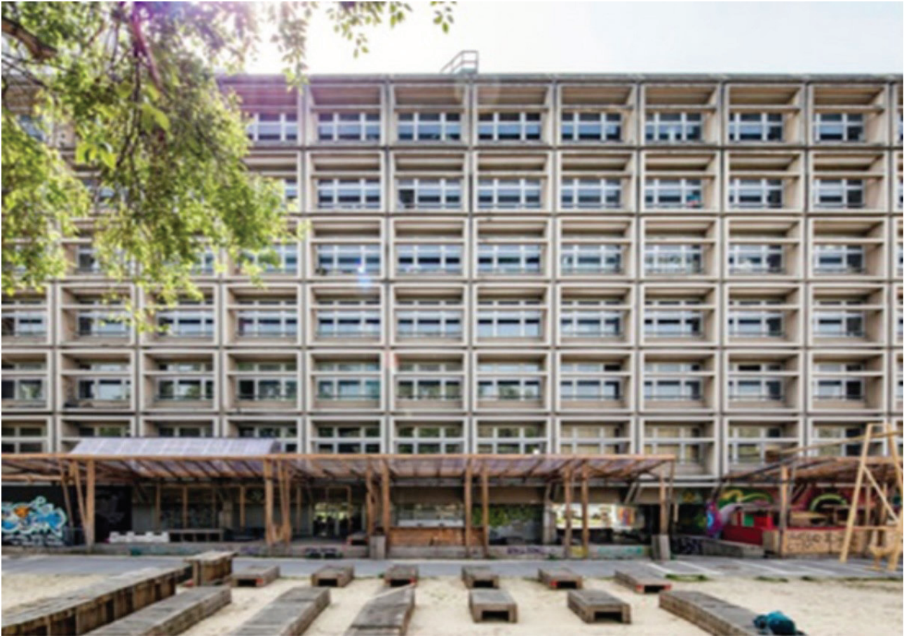
Figure 1. View from building 6b of the facade overlooking the Saint-Denis Canal.

activities, meet the actors, conduct informal interviews with them, and apprise them of our research interest, which allowed us to secure access to the field over time. Given the limited knowledge of CCTPs, this study is exploratory. 6b has been recognized as an emblematic and pioneering CCTP and a territorial factory. 2 It is a representative case of positioning between the underground and upperground levels. For Yin (2017), the single-case design is eminently justifiable in conditions where the case is representative or typical or where the case serves as revelatory. In addition, the 6b administrative teams and artists warmly welcomed our research and supported us throughout the data collection.