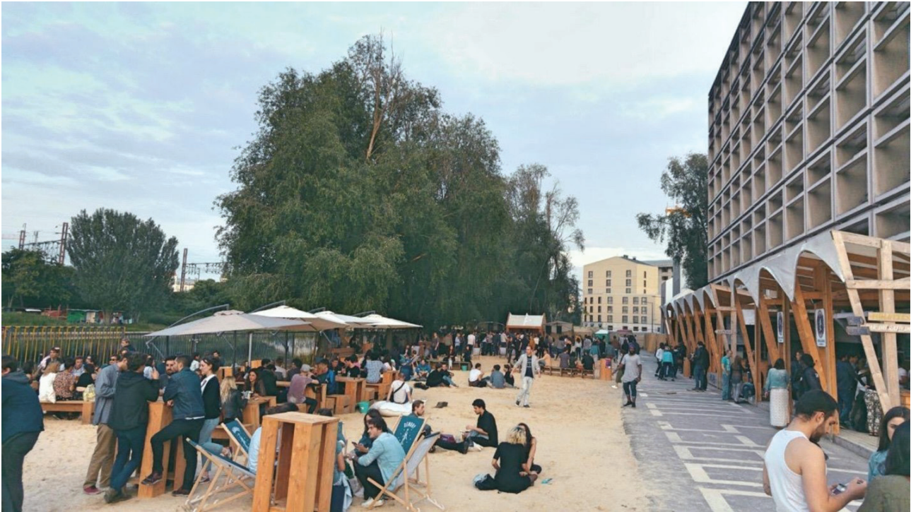
Figure 2. Festive event at the outside 'beach' space.

the awareness of the vision of the evolution of the place. Additionally, the price per square meter rose from a symbolic euro to 12 euros in 2017. In May 2018, 6b, on its founder's initiative, took part in the 16th Venice Biennale of Architecture in Italy. 6b was presented as one of 10 pioneering and experimental places that were highlighted. The collective moments experienced in Venice also allowed a reflection to occur on the identity and future project involving the place and even its perpetuation as an 'infinite place'. 3 After this collective moment, the activation of the place truly began to develop. In this period, two other tensions emerged: architectural constraints versus work needs (tension 2), followed by informal adjustment versus structuring (tension 3).