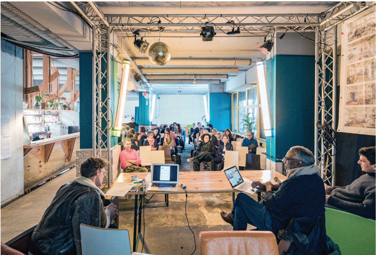
Figure 4. The restaurant transformed for an assembly meeting.

The lived dimension in 6b was powerful for its residents, and the representation of the place was important because it symbolized a place of freedom, play, experimentation, and resistance outside the institutional art world as constraints of the market. The identity of the place was marked by the inclusion of different artistic and creative fields, but sometimes the multidisciplinary identity was controversial and created tension between the artists and the coordination team; some wanted to specialize in a single