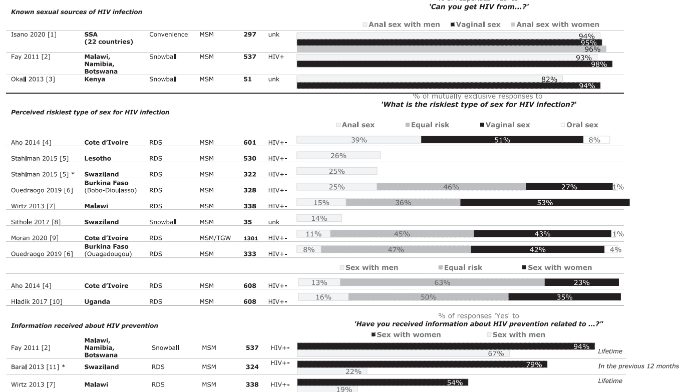
Figure 2. Synthesis of studies with quantitative data about HIV knowledge, HIV acquisition risk perception and HIV information received in men who have sex with men (MSM) in SSA in terms of sex with men and with women.

by the applicable Creative Commons Licens