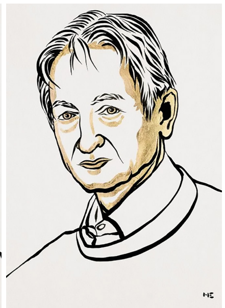
John J. Hopfield and Geoffrey Hinton