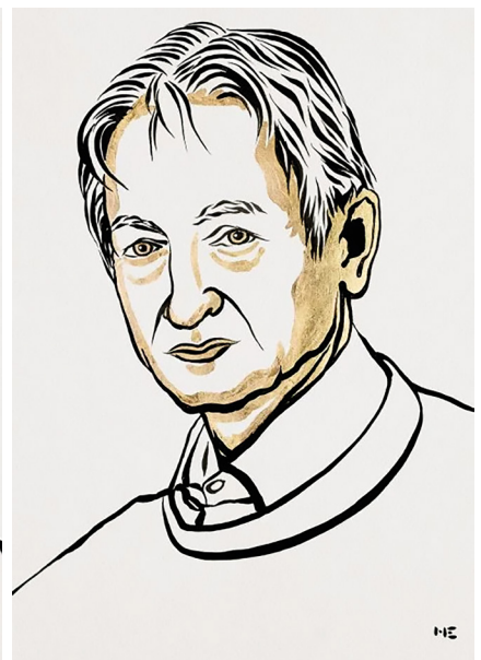
John J. Hopfield and Geoffrey Hinton