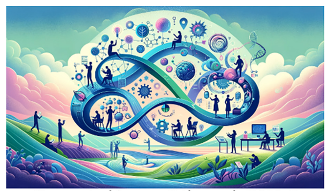
Generated image 1 through DALL-E