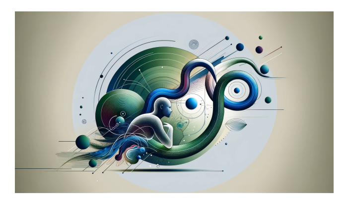
Figure 1: Image created by ChatGPT Dall.e: The promotional image has been adapted to include a serpentine form in the center, symbolizing the dynamic and interconnected nature of the human-centered research cycle in the development of new technologies. The generation process and prompts can be found in Section A.1.

employing GenAI: Are users still in control? Thus, this has attracted interest in the HCI community for studying functional improvements and their potential societal implications for future interactive systems (cf. in educational sectors [5]).