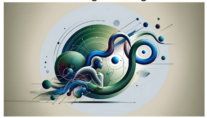
Generated final image through DALL·E