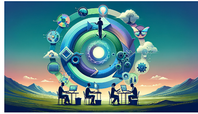
Generated image 3 through DALL-E