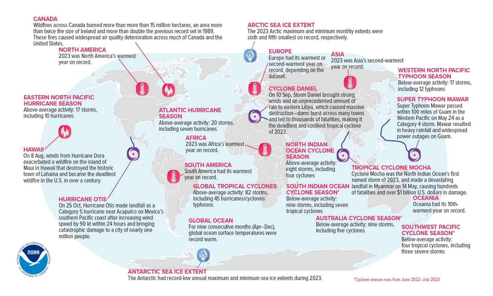
Fig. 1.1. Geographical distribution of selected notable climate anomalies and events in 2023.