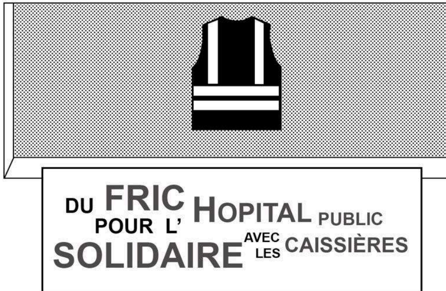
Figure 1: the slogan reads "Money for the public hospital, solidarity with the cashiers 12 ". Illustration based on a photo from a collaborative collection of protest banner photography collected on Twitter under the hashtag #CortègeDeFenêtre.