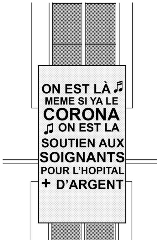
Figure 3: the banner reads "We're here even if there's corona; We are here; Support for caregivers; For the hospital; + money 20 "