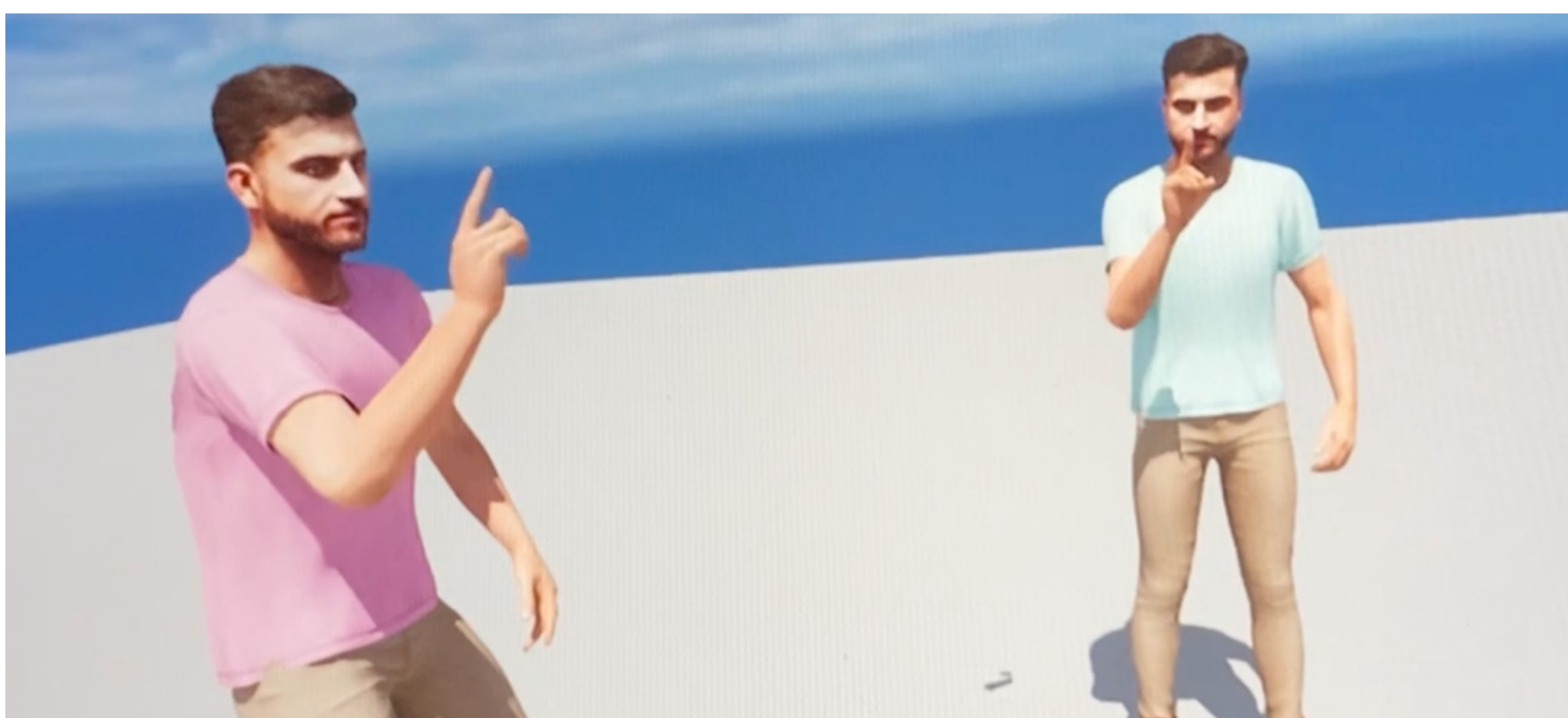
Illustration of the virtual environment and avatar representations

7 triads ( N = 21 ) completed oscillatory movements with their right arm in VR under three conditions; manipulating visual coupling (SOLO) and synchronization instructions (TOGETHER and SYNCHRO).