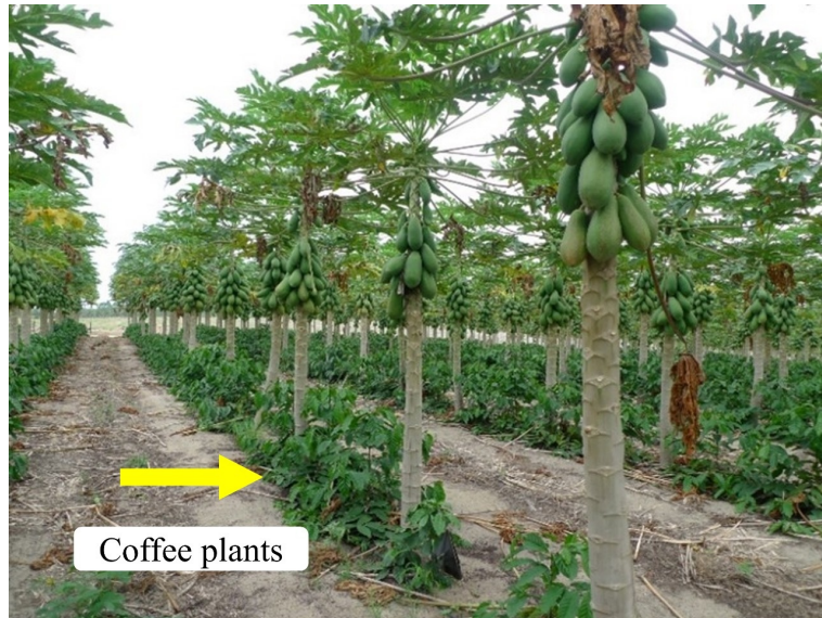
Figure 1 Intercropping of coffee with papaya – Boa Esperança, Espírito Santo, Brazil.

determined. As damage has occurred in the growing season, when plants are most sensitive to injuries, it may be significant if control measures are not adopted.