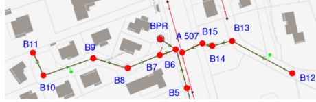
Figure 1: Example of a cropped section from one of the images in the dataset.