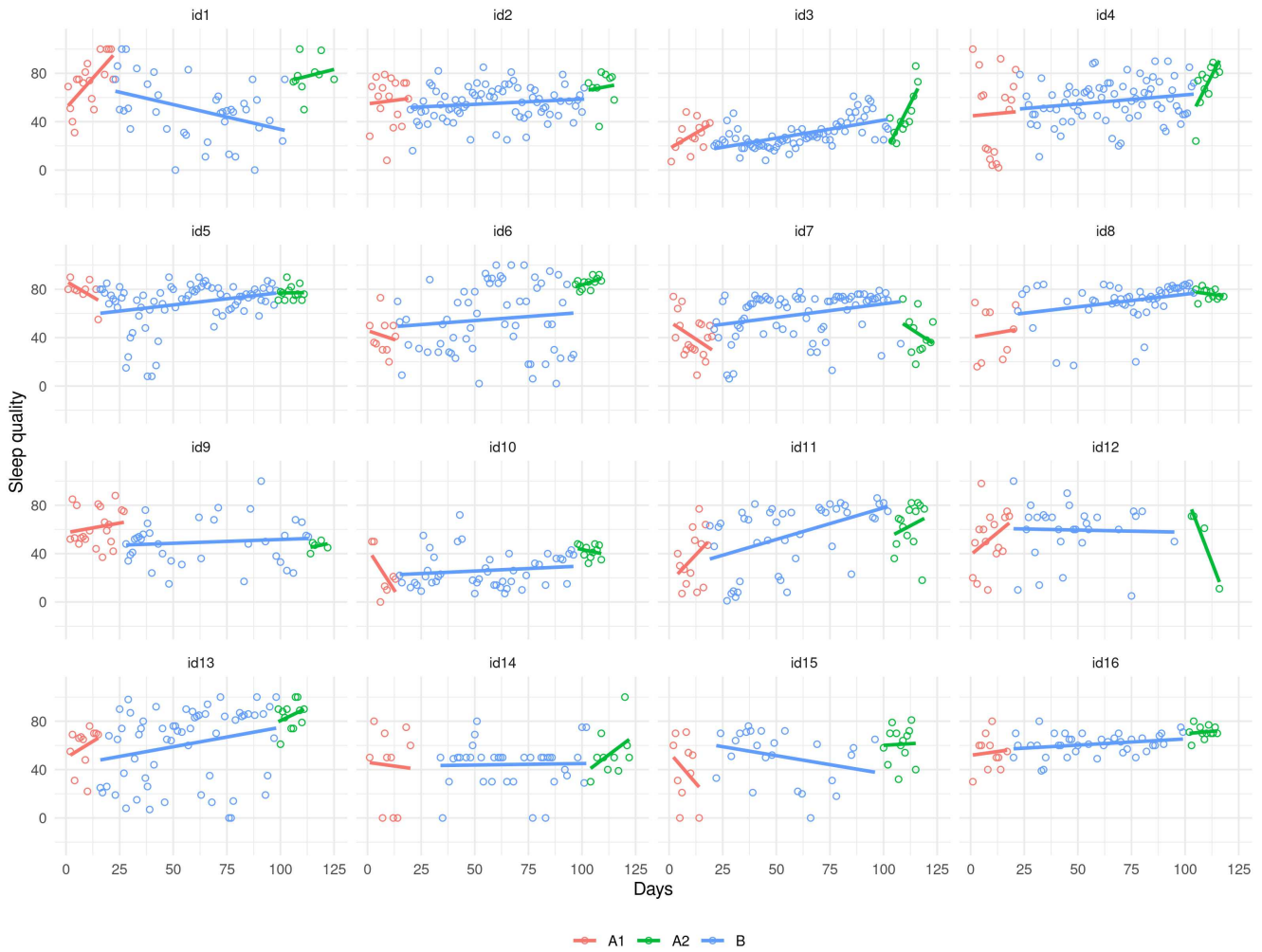
Figure 1. Daily self-reported sleep quality by phase (local regressions)

Notes. A = first observational phase; B = intervention; A2 = second observational phase