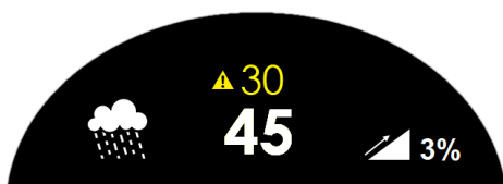
Figure 1: Speedometer with additional indicators for the weather, steepness or overspeeding