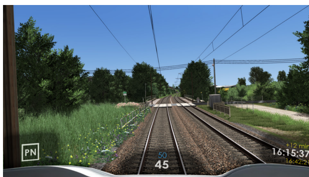
Figure 4: Preview of HUD within the train cab

information; (2) the estimated time of arrival to the next stop; and (3) the estimated advance or delay compared to the expected objectives. In the example of Fig. 2, the train is expected to arrive about 12 minutes late to the next objective. They are displayed in yellow to alert about the difference compared to the objective and suggest, if possible, an action from the driver. However, these choices are for illustrative purpose only and may be adjusted for actual experiments. Indeed, although the colour choice is important for the readability and efficiency of the information [24], they must also respect strict safety standards for dig-