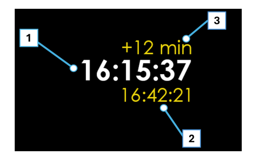
Figure 2: Current time indicator featuring estimated time of arrival and delay