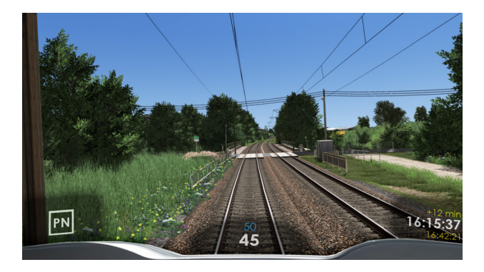
Figure 4: Preview of HUD within the train cab

information; (2) the estimated time of arrival to the next stop; and (3) the estimated advance or delay compared to the expected objectives. In the example of Fig. 2, the train is expected to arrive about 12 minutes late to the next objective. They are displayed in yellow to alert about the difference compared to the objective and suggest, if possible, an action from the driver. However, these choices are for illustrative purpose only and may be adjusted for actual experiments. Indeed, although the colour choice is important for the readability and efficiency of the information [24], they must also respect strict safety standards for dig-