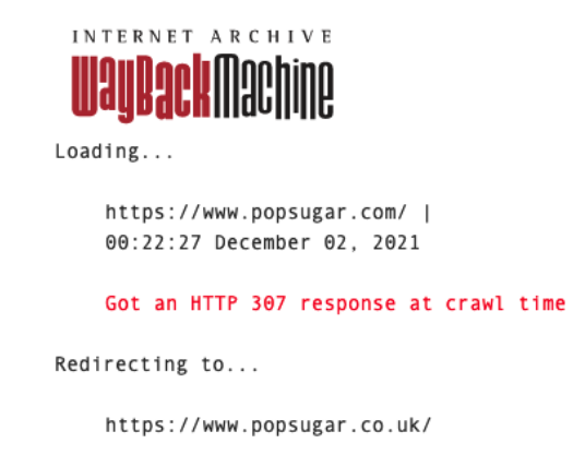
Figure 2. Error on Wayback Machine

At last! A search returned an interesting sentence: "As a non-binary, Black tall person, there's no game where I see myself completely in that world." The blog post had a promising title, Black Gamers Still Don't Fully See Themselves in Games . However, the link pointed to a page so old<sup>14</sup>, which, once again, rerouted to a non-existent article.