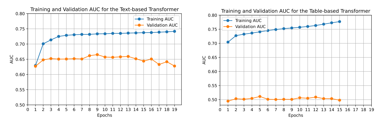
Figure 1: Training and validation AUC performance of models trained under cross-table shift setup. Left: text-based model and right: table-based approach.