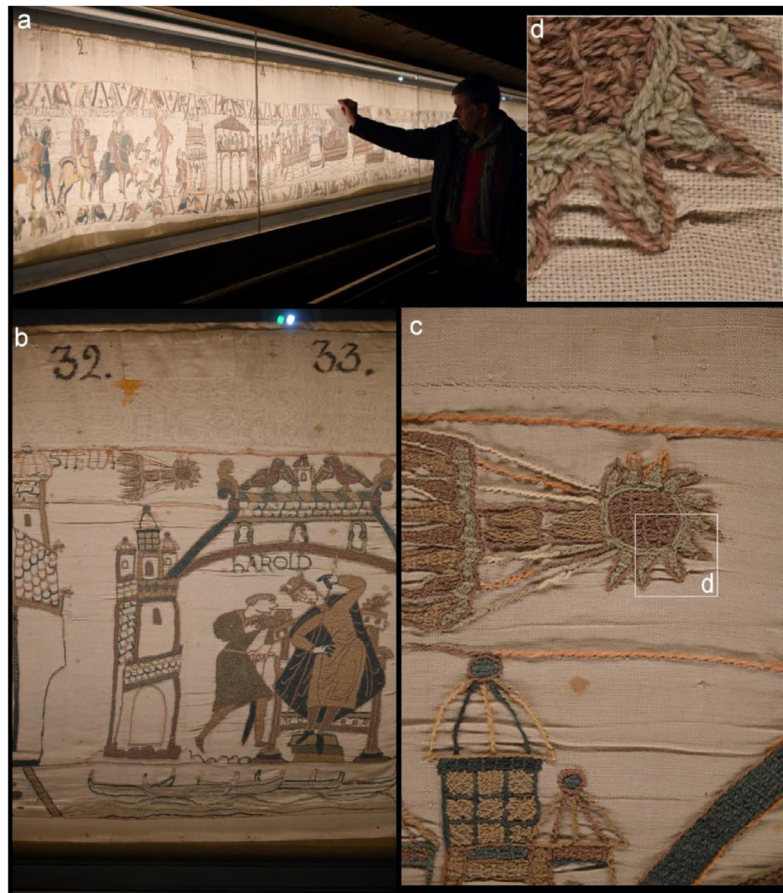
Fig. 1. The original Bayeux Tapestry, dating from the 11th century, exhibited at the Bayeux Tapestry Museum, Bayeux, Normandy (France). (a) The Bayeux Tapestry under its protective glass window. (b) Example of a single frame taken with a Nikon Z7II camera, from a distance allowing a complete coverage in height in a single pass. (c) Example of a close-up image on the Halley comet, taken close to the protection window (with a zoom in d showing the level of details).