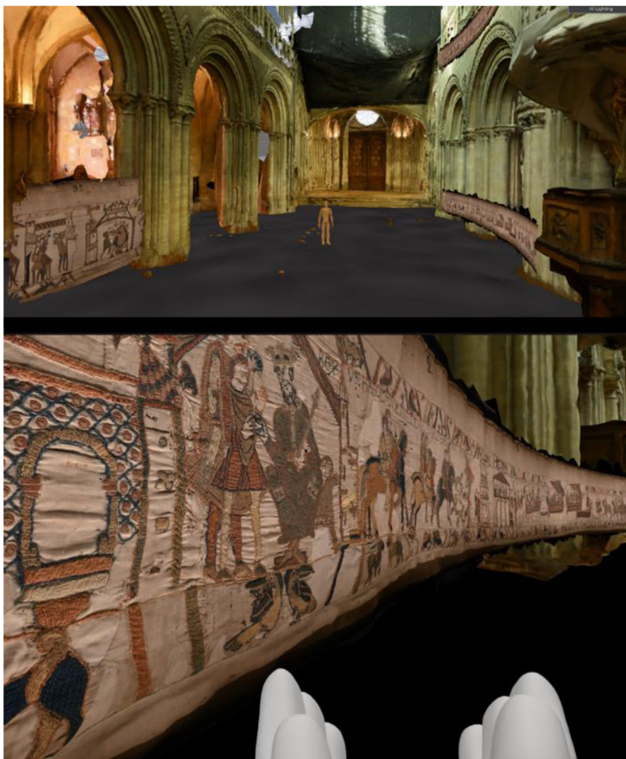
Fig. 4. Virtual Reality scene integrating parts of the Tapestry into the Bayeux Cathedral interior. The first seven scenes of the Tapestry are included for demonstration purposes, together with an enlargement of Scene 32 showing the Halley comet. The embroidery can be investigated from few cm only (closer than in real life because of the protecting window). The exaggerated size of scene 32 allows the users to discover details of the tapestry while being at the same height as the main characters, reinforcing the feeling of immersion into the scenery. The VR Scene is accessible at https://steamcommunity.com/sharedfiles/filedetails/?id=2928526155 . (For interpretation of the references to colour in this figure legend, the reader is referred to the web version of this article.)

(seen on the left of the upper panel of Fig. 4) displays another way of investigating the scenery, emphasizing details and reinforcing the feeling of immersion into the storyboard.