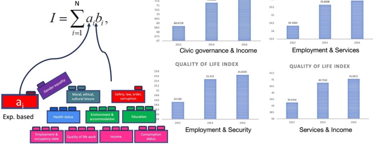
Fig. 2. QoL Indices 2012 - 2016 in La Condesa

correlate with specific actions under the public policy program Bando 2. Current efforts focus on studying this correlation by collecting data from social networks, dedicated surveys involving long-term and temporary residents, newly installed cameras in the neighbourhood, and alternative transport startups. These sources will contribute subjective data commonly used in the literature to measure well-being and QoL.