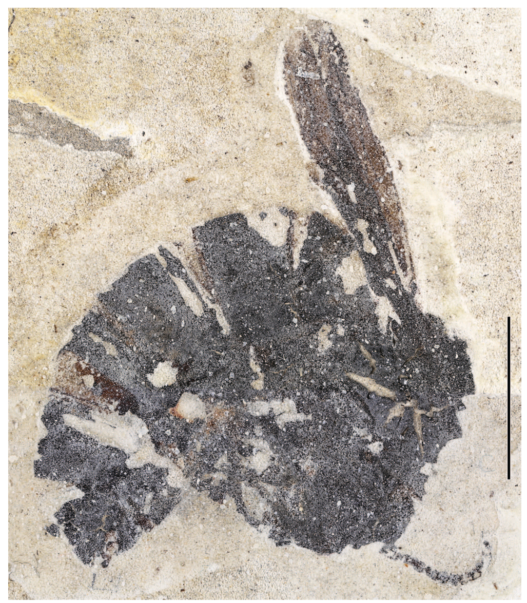
Fig. 2. – Vespa ( Intervespa ) tortonica n. subgen., n. sp., holotype (MNHN.F.A95075) female (part), detail of wasp only. Scale bar = 1 cm.

Description of female. – Total body length 41.18 mm (head length 5.89 mm, vertex to medial apex of clypeus; mesosoma length 10.62 mm; metasoma length 24.67 mm, not including sting); forewing length 21.3 mm. Integumental sculpturing and coloration not preserved (preserved as dark black carbonaceous compression). Head apparently slightly wider than long (oblique orientation prevents precise measurements so estimated by preserved contours); compound