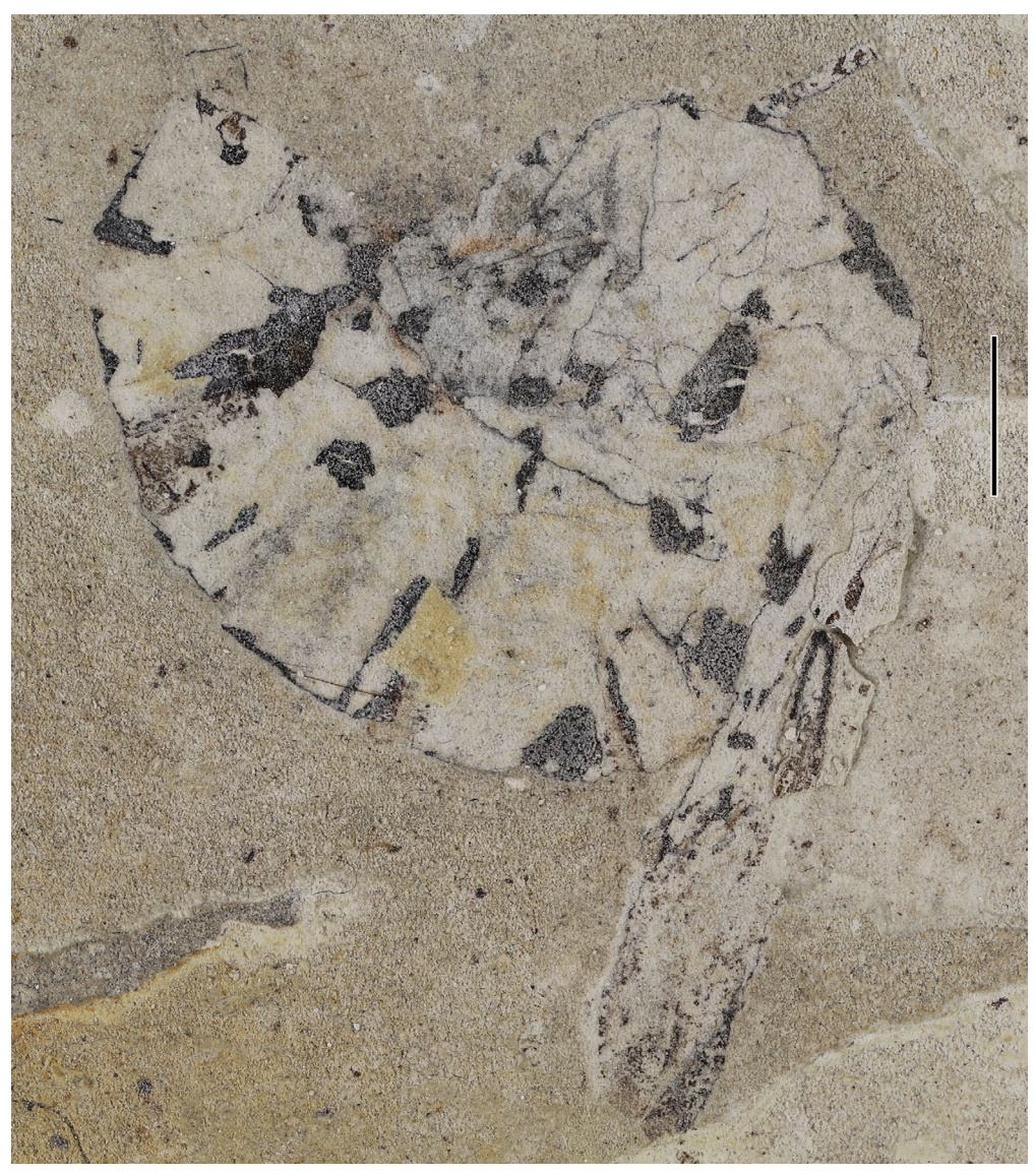
Fig. 4. – Vespa ( Intervespa ) tortonica n. subgen., n. sp., holotype (MNHN.F.A95075) female (counterpart), detail of wasp only. Scale bar = 1 cm.

than truncate and appendiculate, and variably separated from the costa, and 1cu-a prefurcal or confluent with 1M. As in Stenogastrinae + Polistinae + Vespinae, the marginal cell is pointed apically on the costa and is not appendiculate (fig. 7), and it shares with Vespinae + Polistinae the pretarsal claws secondarily simple (fig. 8). The fossil can be excluded from Polistinae as the apical margin of the clypeus is broadly straight between short, rounded, apicolateral angles (fig. 9) (in polistines the clypeus is pointed medioapically, sometimes appearing trilobate when apicolateral angles are produced). Furthermore, the metasoma is sessile with tergum I abruptly declivitous anteriorly (fig. 2, 8), while it is petiolate to subsessile in Polistinae. In addition, the fossil can be excluded from Stenogastrinae owing to the plaited forewings (fig. 1-5, 7)