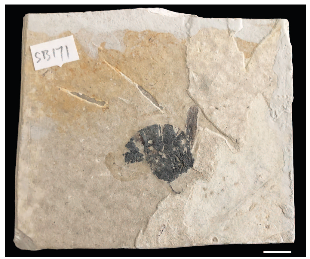
Fig. 1. – Vespa ( Intervespa ) tortonica n. subgen., n. sp., holotype (MNHN.F.A95075) female (part), entire stone. Scale bar = 1 cm.

The fossil reported here comprises the part and counterpart of a female (fig. 1-4), largely compressed laterally except the head is obliquely turned and slightly forward, thereby showing much of the face (fig. 2, 5, 9). The wings are folded, typical of most Vespidae, and extended straight back over the mesosoma and above the basal segments of the metasoma, which itself is turned downward (fig. 1-5). Overall, the wasp is in a hunched and folded position owing to the clustering of the legs beneath the mesosoma, the lowering of the head (and perhaps slightly detached from the mesosoma during deposition), and the ventrally bent metasoma. The part is represented by a carbonaceous material while the counterpart is merely an impression. At first glance, the fossil does not appear to preserve much detail but upon finer inspection a rather significant number of characters can be discerned, including additional traits when viewed using UV-A light, a method growing in application for paleoentomological studies (e.g., NEL et al., 2023; BODERAU et al., 2024a, b). With care the anterior wing veins can be followed, thus permitting identification of the fossil. However, given the nature of the preservation, the species description is kept rather limited so as to avoid any over-interpretation. Naturally, it is hoped that additional material will be discovered of this quite interesting species.