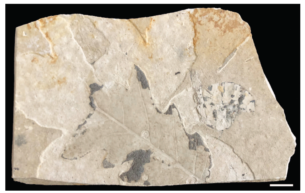
Fig. 3. – Vespa (Intervespa) tortonica n. subgen., n. sp., holotype (MNHN.F.A95075) female (counterpart), entire stone. Scale bar = 1 cm.

The current fossil, despite its rather challenging preservation, can be attributed to the subfamily Vespinae based on several characters. Based on apomorphies established by CARPENTER (1982), the fossil can be assigned to various clades within the family. Like Eumeninae + Zethinae + Stenogastrinae + Polistinae + Vespinae, the forewing first medial cell (= discal cell) is greatly elongate (fig. 7). Euparagiinae and Masarinae may be further excluded by the marginal cell apex on the costa rather