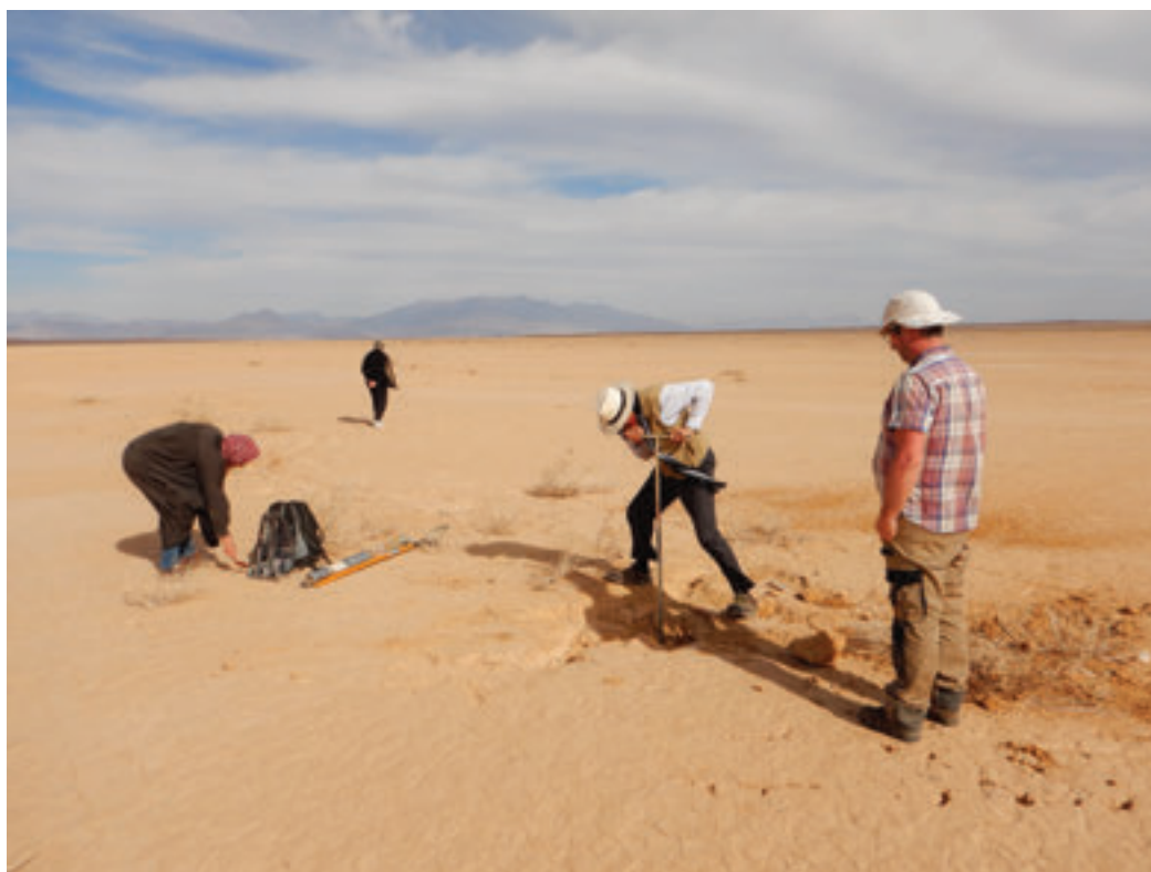
أ. رفع عينة من طبقة السبخة جنوباً من البدع. a. Manual core drilling in a sabkha 30 km south of al-Bad' (BD2019a0098B, G. Charloux).