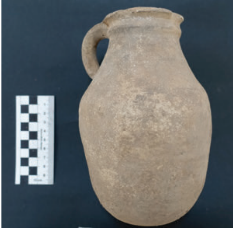
أ. جرة سليمة اكتشفت في المنطقة ٢. a. Complete jug O.20086-1 discovered in Area 2.