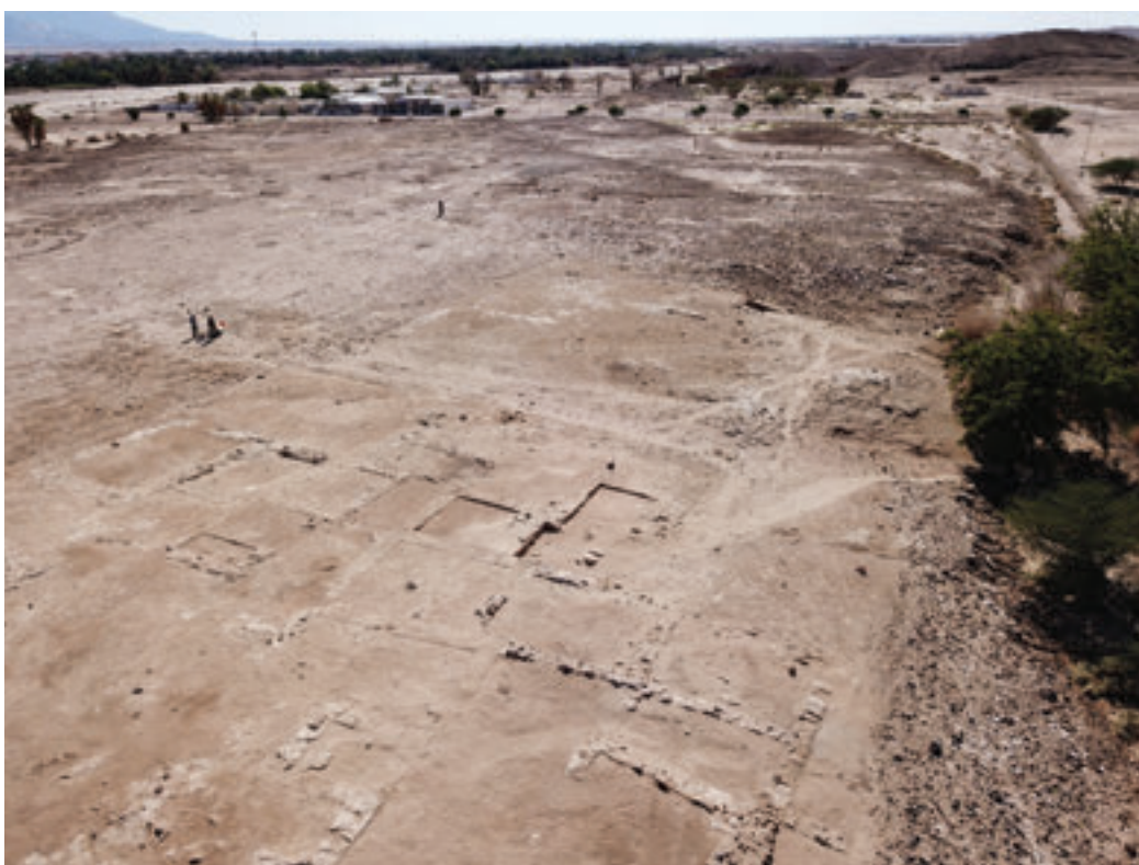
ب. المنطقة ٣ وتطهير شامل للقطاع. b. Area 3. Extensive clearing of the sector (BD2018d0408B).