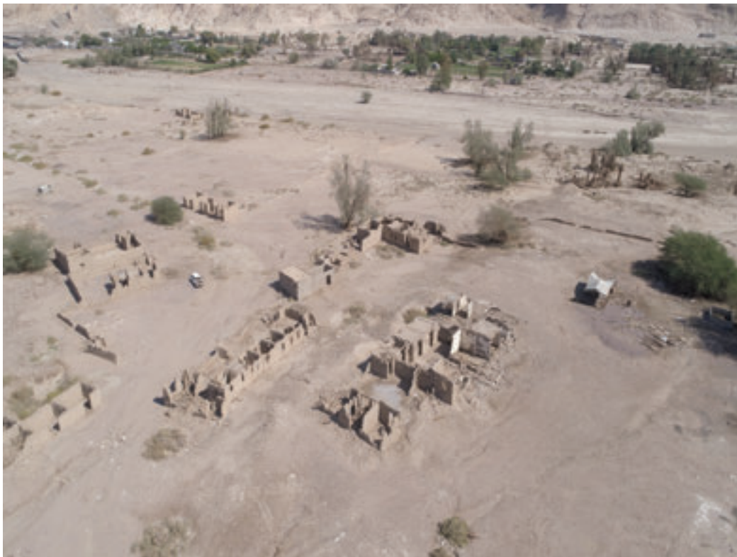
ب. القرية الحديثة في المالحة. b. Modern village standing above the site of al-Malha (BD2018e0623B).