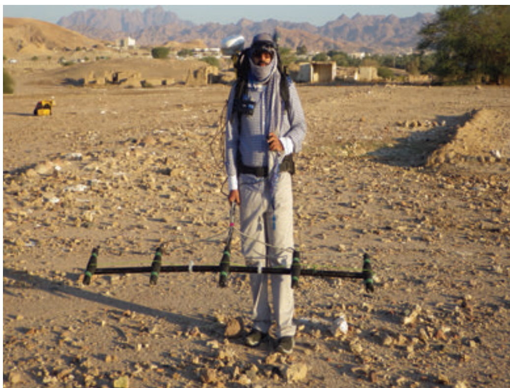
ب. المسح الجيوفيزيائي

a. Orthophotography of the T464 façade tomb at al-Bad' (L. Bigot & K. Guadagnini, BD2018a0354).