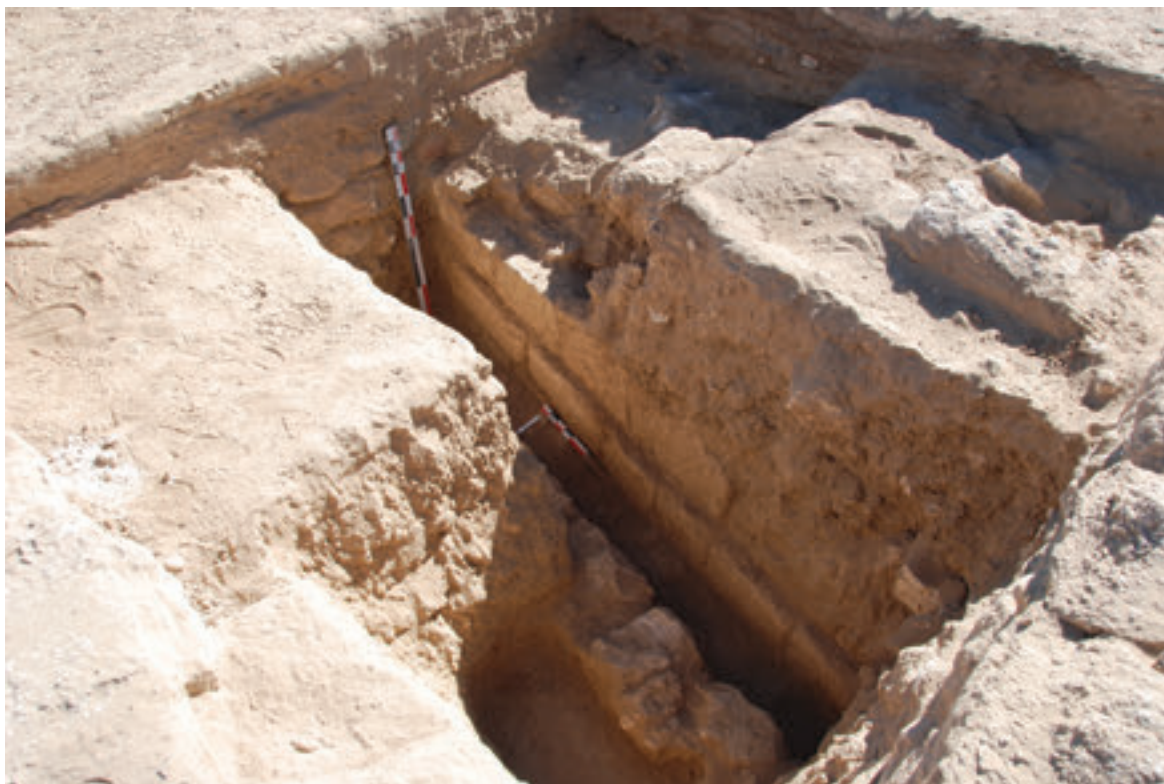
أ. الكشف عن جدار من حجارة كبيرة في مربع الاختبار بمنطقة ١. a. A wall with large blocks in the test trench opened at area 1 (BD2018b0255B).