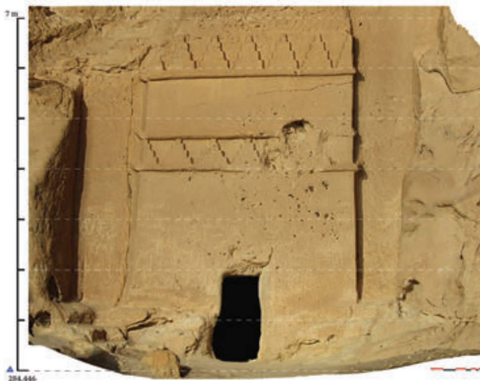
أ. صور لواجهة قبر في البدع.

a. Orthophotography of the T464 façade tomb at al-Bad' (L. Bigot & K. Guadagnini, BD2018a0354).