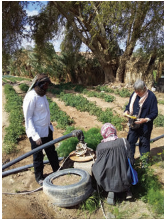
ب. تسجيل القياسات في واحة البدع عن عمق الآبار وكمية المياه.

a. Studied geomorphological section (n o 2) in the oasis (BD2019a0190B, M. Dinies).