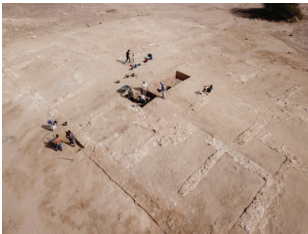
ب. المنطقة ٢ بعد تنظيفها وتحديد النواحي المستهدفة بالمسح في المبنى. b. Area 2, after a general removal and the opening of target surveys within the building (BD2018c0278B).