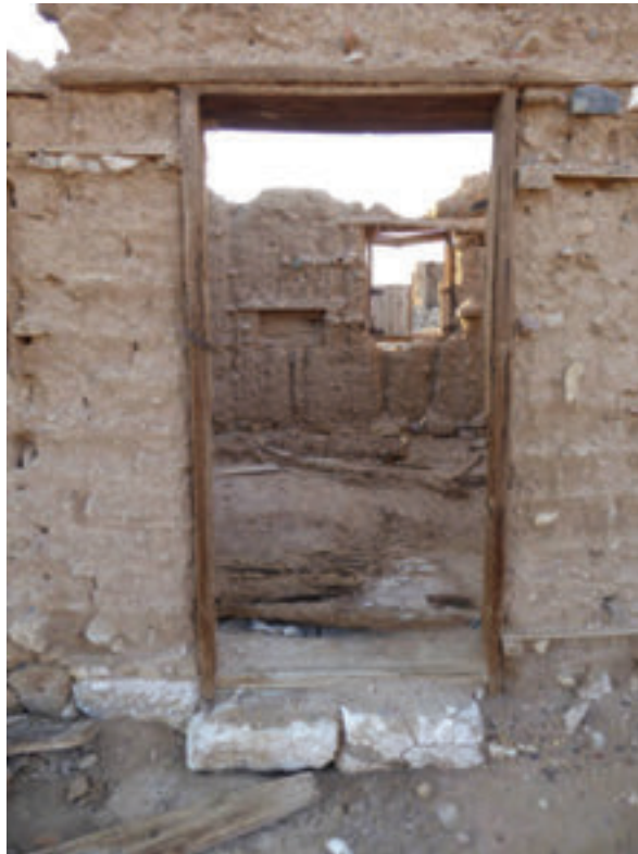
أ. أطلال من قرية المالحة.