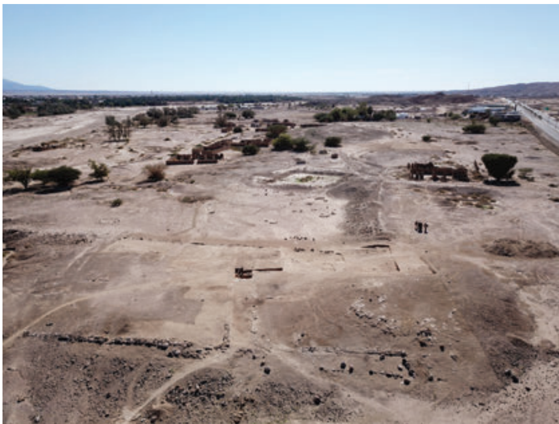
ب. مبنى كبير في المنطقة ١ في أثناء التنقيب. b. Large building at area 1 during excavation (BD2018b0286B).