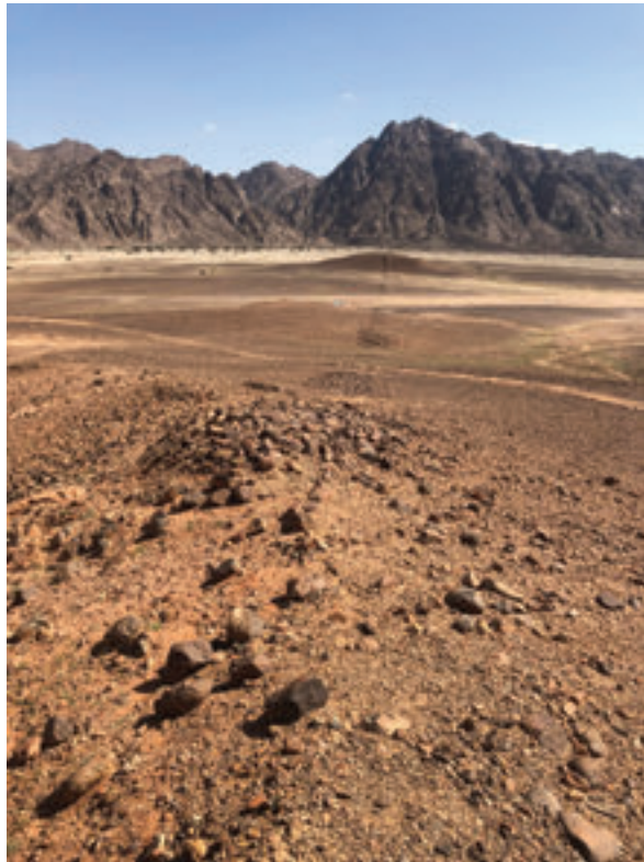
أ. منشأة مما قبل التاريخ شيدت على هيئة صف مستقيم a. Megalithic rectilinear and prehistoric structure identified during prospection (BD2019a171B).