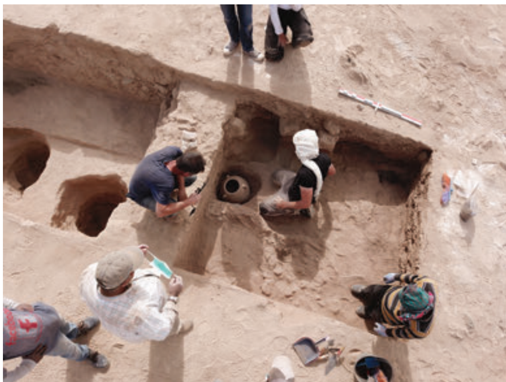
أ. الكشف عن جرة صحيحة في منطقة ٢. a. A complete jar being cleared in area 2 (BD2018c0287B).