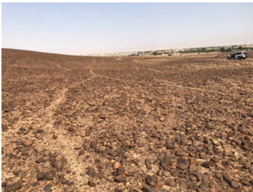
ب. موقع من العصر الحجري القديم الأوسط. b. Middle Paleolithic site BD1035.