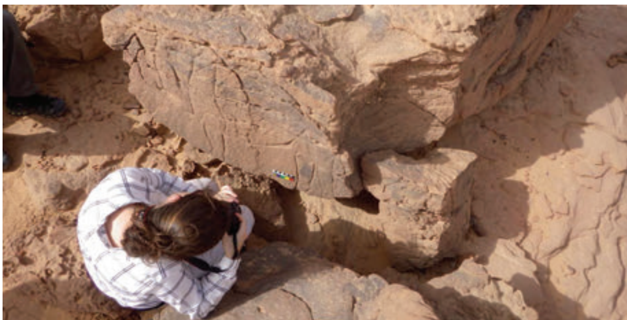
ب. تصوير تفاصيل نحت جمل عربي وآثار أدوات النحت. b. Photography of details and tool marks of the dromedary on Panel 13