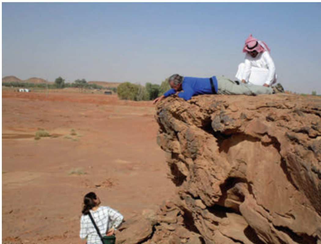
أ . فحص طبقة التقادم على النحت رقم ٢ . b. Patina examination on panel 2.