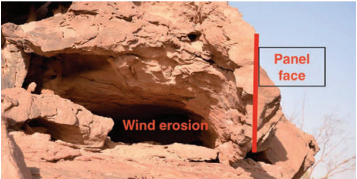
ب. آثار الرياح على النحت وتناكله. b. Wind erosion behind a carved rock panel