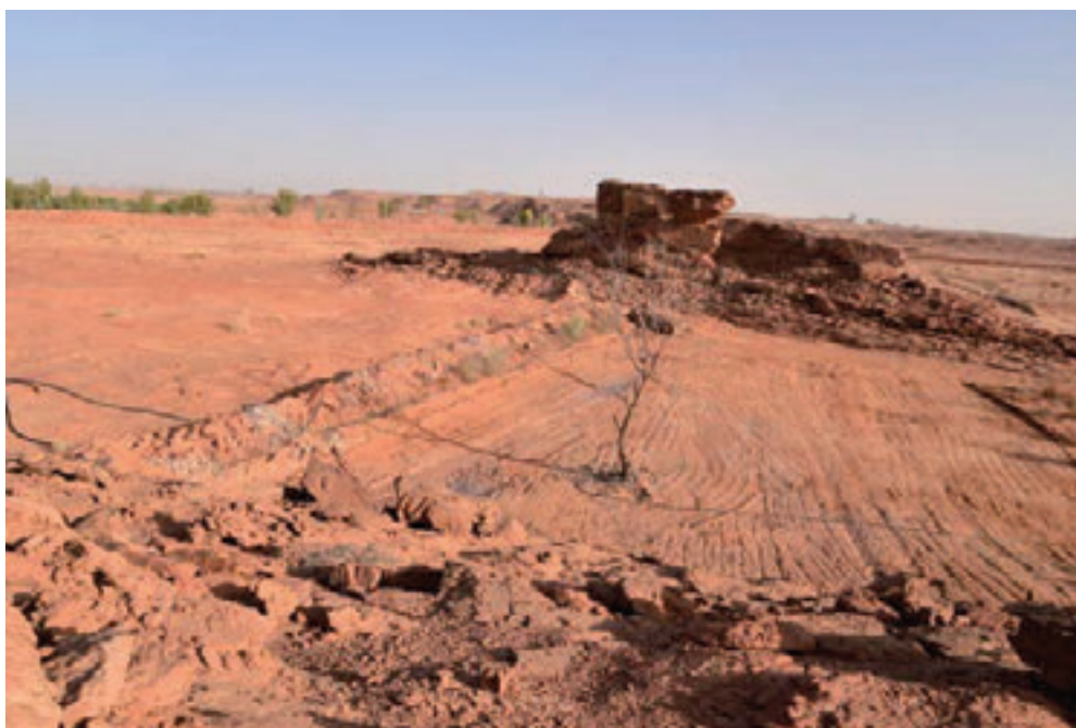
ب. تضرر موقع الجمل بالآليات الثقيلة والجرافات والحرث. b. The bulldozed area between spur a and b, with ploughing, and panel 8 moved by the bulldozer