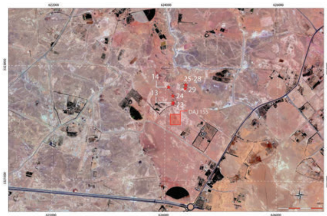
أ. خريطة موقع الجمل وموقع الفنون الصخرية. a. Map of the buffer zone of the Camel Site with the location of rock-art panels