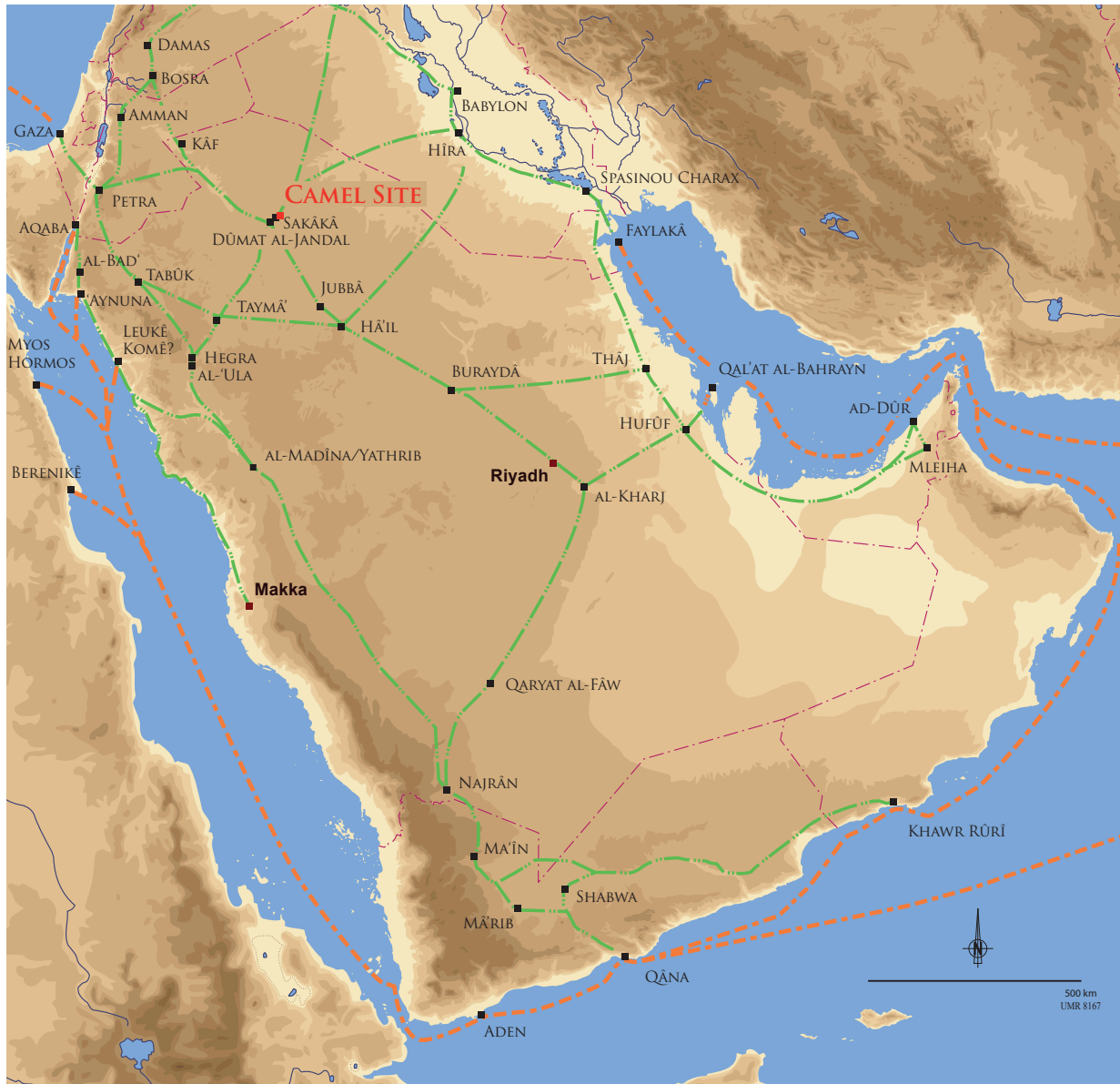
أ. خريطة موقع الجمل في منطقة الجوف. a. Location map of the Camel site in Al Juf Province

Map By Guillaume Charlaux and Romulo Lorito