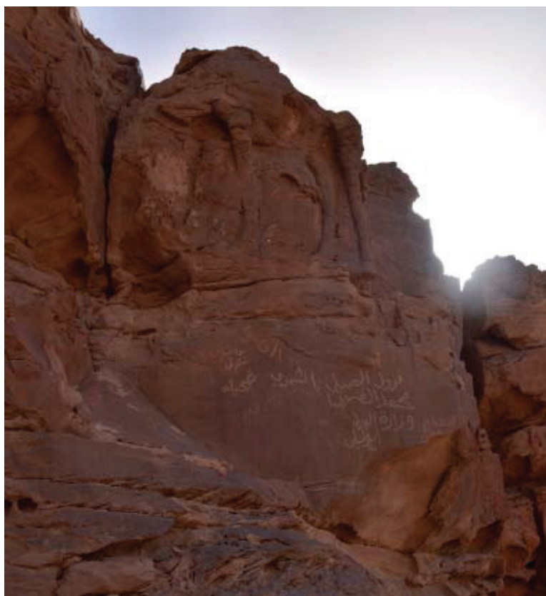
أ. نحت الجمل وتضرره من الكتابة والنحت عليه. a. Eroded camel carving with graffiti and damage through pecking.