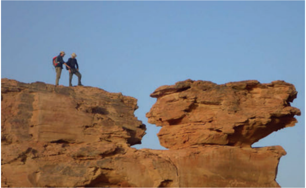
أ. مختصون يدرسون آثار عوامل التعرية على الحجارة الرملية بموقع الجمل. a. Study of erosion process of the sandstone at the camel site by the specialists.