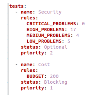
Figure 8: Excerpt of the Deployment Instructions file for the Smart Parking system.

and Kubernetes. We also considered two important QoS requirements which are security and deployment cost. Figure 8 shows the corresponding Deployment Instructions file as specified by the FSA.