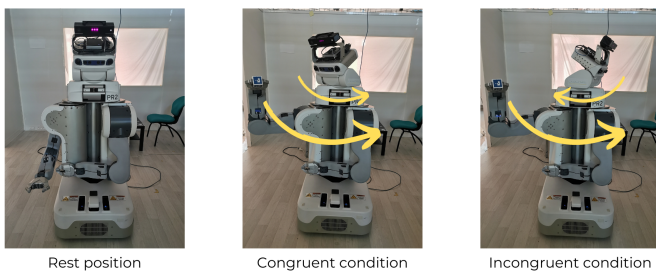
Fig. 1. PR2 main behaviours

In order to induce various cognitive effort levels, a digit span task was used. This typical memory-load task has already been applied with success to robotic tasks monitored via EEG [10]. Here, the digits were displayed sequentially on a screen located on the wall near the robot. Sequences of 1, 3 and 7 digits were expected to result respectively in a low, medium and high cognitive effort.