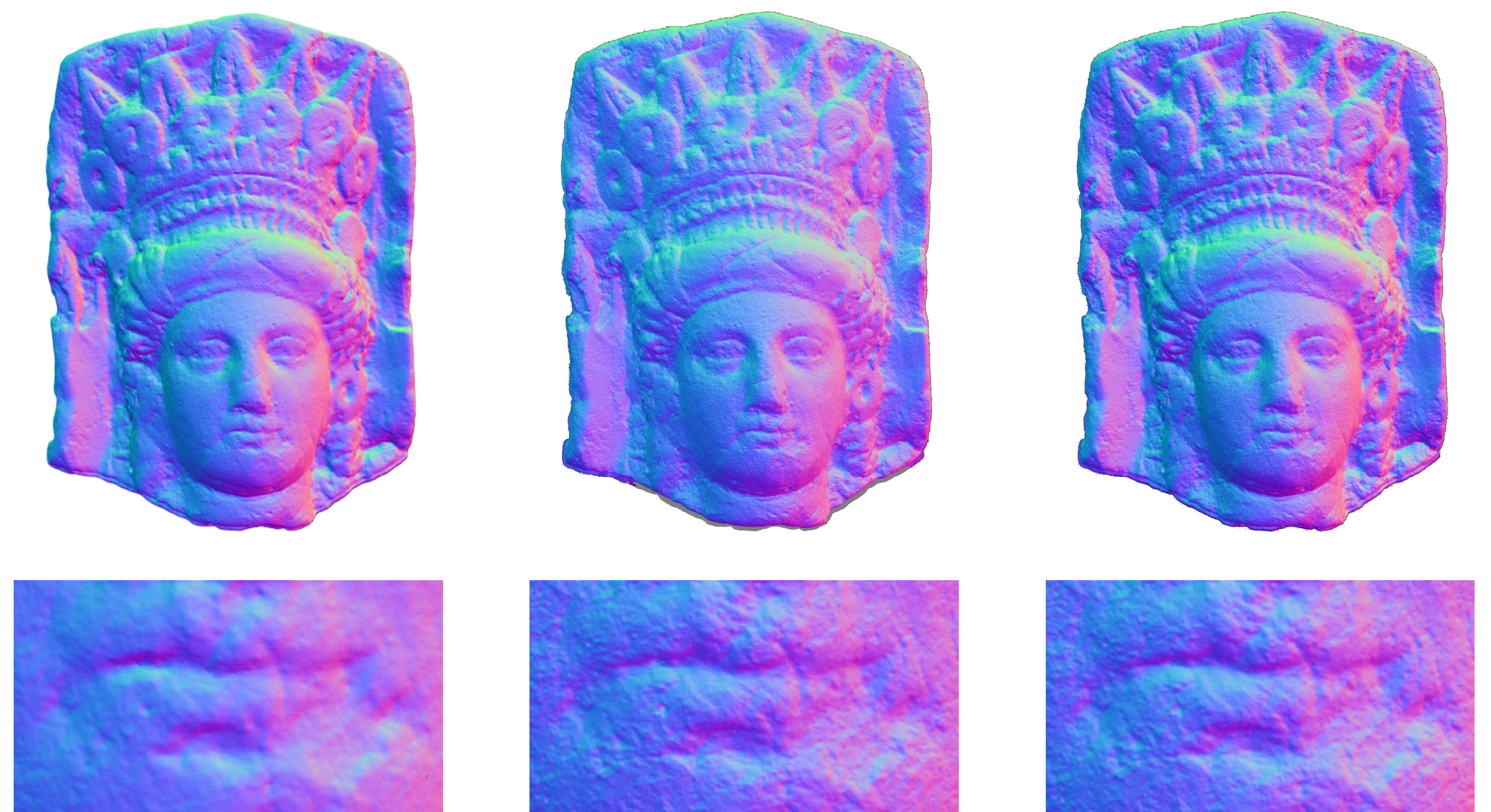
Normal field of a Cypriot calathos head. From left to right: photogrammetry, calibrated PS, scene-calibrated PS.