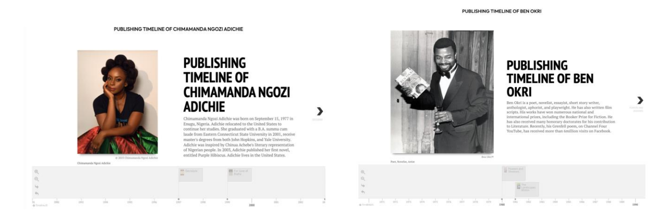
Figure 2: Image showing the publishing timelines, awards, and translations of Chimamanda Ngozi Adichie and Ben Okri were analyzed using digital humanities tools such as KnightLab's TimelineJS and StorylineJS, which revealed significant patterns in their literary trajectories. Visualization of their publishing timelines showed that both authors began their careers in Nigeria, with Adichie's Decision (1997) and Okri's Flowers and Shadows (1980) marking their early entries into literature. However, their migration to the United States and the United Kingdom, respectively, marked a turning point, as their subsequent works were published by prominent Western publishers. Adichie's novels, including Half of a Yellow Sun and Americanah , were published by Alfred A. Knopf, while Okri's The Famished Road and The Last Gift of the Master's Artist were published by Penguin Random House. These visualizations highlight how migration facilitated access to global publishing platforms, enabling broader distribution and international recognition. recent novel was published by Alfred A. Knopf in New York City, U.S. While Okri's recent novel is also published by Penguin Random Houseby in the USA as well.