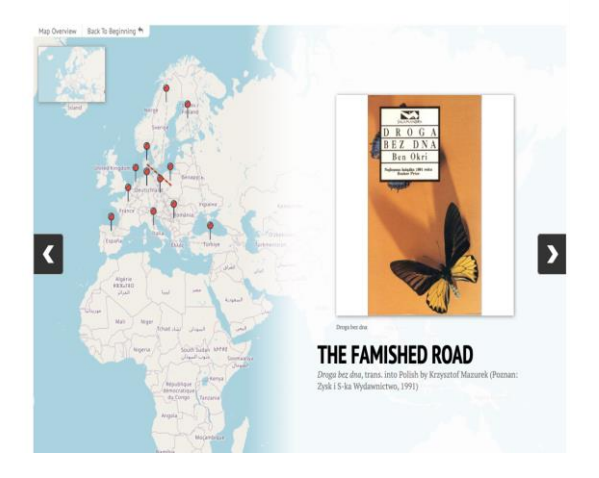
Figure 4: Figure 6: This image illustrates the translations of these authors' novels into various languages. The information was sourced from the authors' official websites, Goodreads, Amazon, and the CEREP DH project led by Daria Tunca at the University of Liège. KnightLab's StoryMapJS served as the visualisation tool, and the results were automatically generated after populating a Google Sheet template with the data.