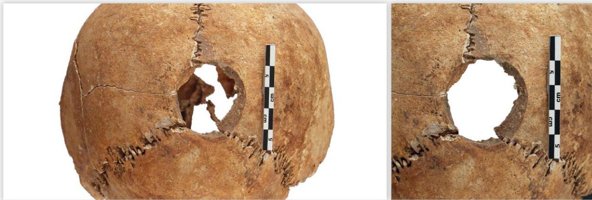
Figure 4: Archeohandi page for viewing information about a subject.

The operation sheet first displays a location map of the site with Leaflet, the free JavaScript library for online mapping (Edler & Vetter, 2019). The subject information includes some elements from the HumanOS application (Colleter et al., 2020). Among them, sex determination (Brůžek, 1991; Brůžek, 2002; Murail et al., 2005; Brůžek et al., 2017) and estimated age of death (Johnston, 1962; Moorrees et al., 1963a; Moorrees et al., 1963b; Stloukal & Hanáková, 1978; Kerley & Ubelaker, 1978; Sundick, 1978; Birkner, 1980; Masset, 1982; Ferembach, 1983; Meindl et al., 1985; Webb & Suchey, 1985; Scheuer & Black, 2000; Schmitt, 2005) methods are numerous in our database. Living environments, types of deposits, burials, and contexts are also considered. Potentially found within a set of skeletons from an operation, each subject is assigned to a group of individuals considered able-bodied, based on the minimum