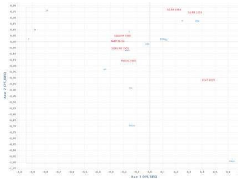
Figure 2: CFA of the distribution of personal pronouns by corpus documents

Chronologically, the pronouns je and on ( you/one or we/they/people ) attract the first part of the corpus (1939-1976) to the left-hand side of the graph, while the two SDRIFs (1994 and 2013) are polarized by the pronouns il , Elle , Elles and Ils ( he , she and they ) (see Figure 2).