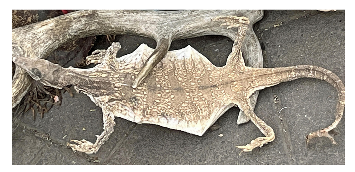
Figure 1. Dried Varanus griseus in a Moroccan market on 18 May 2024.

Additionally, a "cube-shaped" matfia (CUB; Fig. 2C), easily identified by its distinctive, frequently blue metal cover, does not serve as a water reservoir but is part of the water distribution system. It nevertheless may trap monitors.