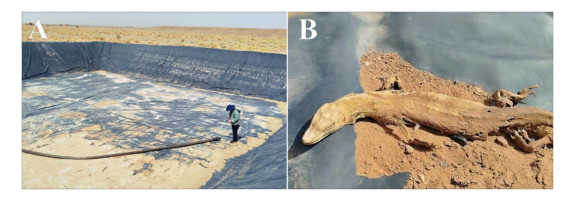
Figure 4. (A) A plastic-lined reservoir used in watermelon cultivation; (B) an adult Varanus griseus found dead in a tank in Zagora (southeastern Morocco).

While our study focused on V. griseus in Morocco, similar observations have been made in the Middle East, where Desert Monitors are commonly found trapped in wells, with many dying as a consequence (Aviad Bar and Guy Haimovitch, pers. comm.). Similarly, the Nile Monitor, Varanus niloticus (Linnaeus, 1766), is often found trapped in wells located in Diawling National Park, Mauritania, and Toubakouta, Senegal (Martínez del Mármol et al., 2024). In Indonesia, particularly around the capital city of Jakarta on Java Island, Twostriped Water Monitors, Varanus salvator bivittatus (Kuhl, 1820), face similar threats (Kevin Geraldhy, pers. comm.).