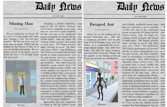
Figure 2: Documents used for priming in the human (left) and the non-human (right) conditions. The documents were printed and the articles were isolated and presented in physical form prior to VR immersion.

The height of the desk and size of the avatar were adjusted in accordance with the respective height of participants. The kinematic