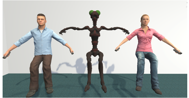
Figure 1: The avatars embodied during the experiment. Participants chose either the female (right) or male (left) depending on their own gender, and were also embodied in the non-human avatar (center). The avatars were scaled to the size of each participant.

It has been demonstrated that self-reports of interoceptive body awareness correlate with heartbeat perception scores in VR tasks [DWM*22]. Participants who exhibit lower body-awareness on self-perceived heart rate measurements also experience less ownership over a rubber hand [TTJC11]. While there is some evidence that body awareness is not disrupted by VR body-swap tasks [CHV*19], mindfulness meditators have reported lower agency during the rubber hand illusion [CMP*16]. The volitional aspect of self-regulation, measured in our study, has also been shown to benefit from, as well as support, mindfulness practice, with reports indicating greater agency in terms of both executive control [TI13] and motor control [NS12] for mindfulness meditators. Uncertainty around the influence of interoceptive body awareness on VR experiences demonstrated a gap in the literature which the study outlined here aimed to partially fill, through the use of the Multidimensional Assessment of Interoceptive Awareness (MAIA) [MPD*12].