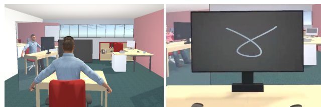
Figure 3: Left: Office scene for experiment with a human avatar. The side mirror was included to show participants the movements of the avatar as mapped to their own movements. Right: Example of shape trace task from the user's point of view. The virtual environment was obtained from Dewez et al. [DFA*19].

We first conducted an ANOVA on the aggregated items for Ownership and found a main effect of avatar ( F(1, 61) = 37.711, p < 0.001, \eta_p^2 = 0.382 ) where higher levels of Ownership were reported for the human than the non-human avatar ( p < 0.001 ).