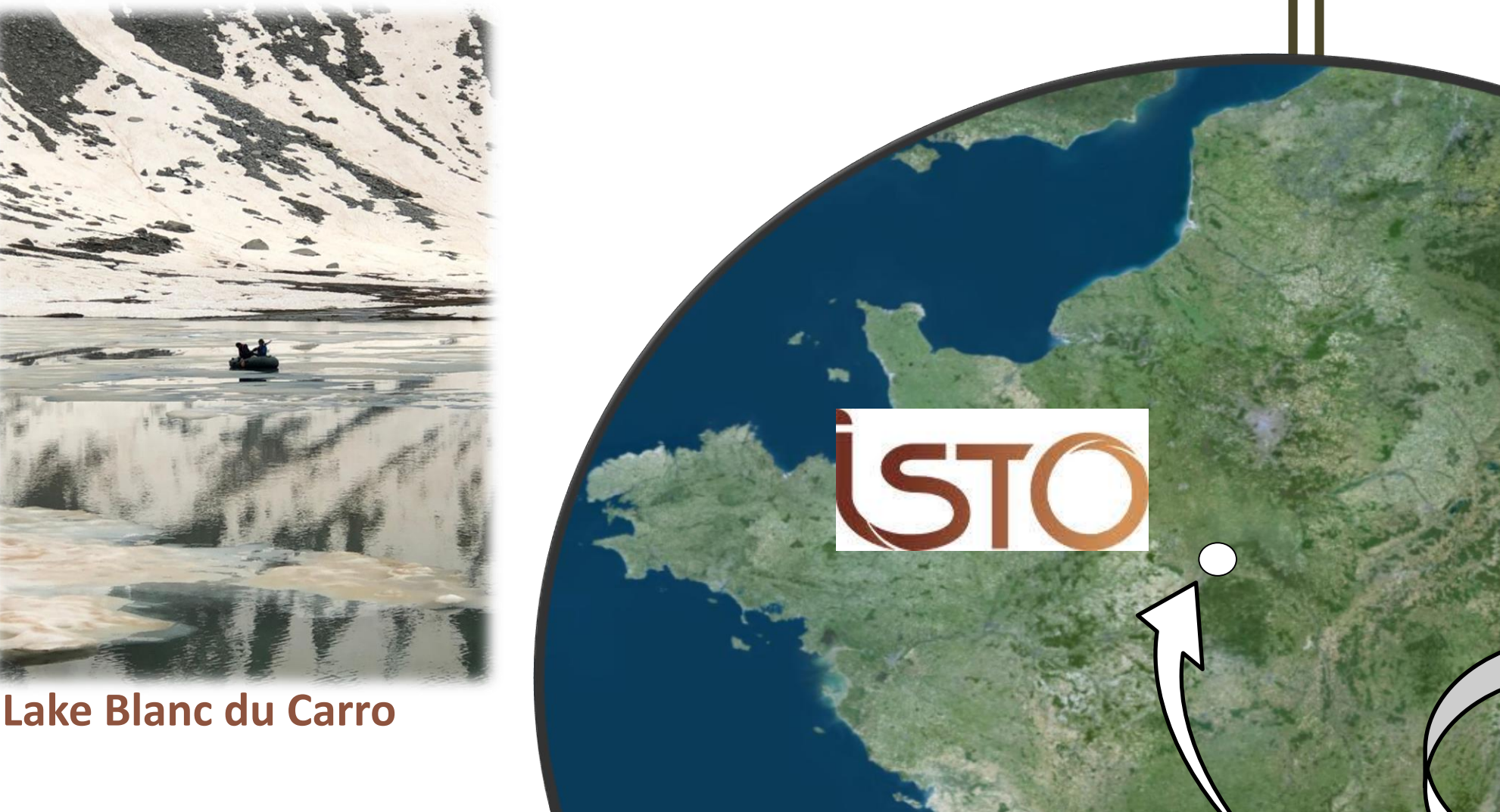
Then, isotopic activity analyses (dating) and physicochemical measurements were conducted in specialized laboratories from destructive sampling.

> Geochemical analyses were conducted on sediment cores to investigate long-term variations in carbon stocks : Organic C, Inorganic C, Total C, Total N, \delta 13C, 15N.