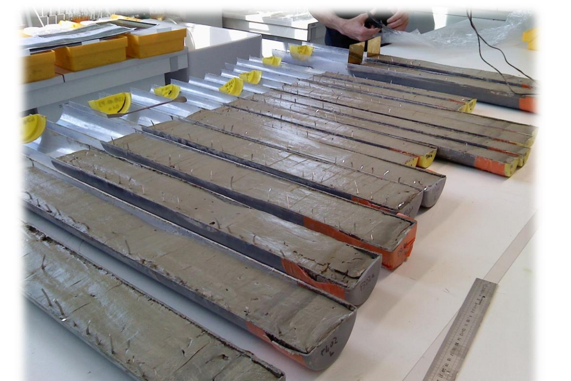
Opening of sediment cores

➤ A multi-proxy comparison was performed to characterize the sources of organic matter accumulated in the sediments: Quantitative palynofacies, quantification of acids and alkanes, HPLC Pigments and Hyperspectral analysis.