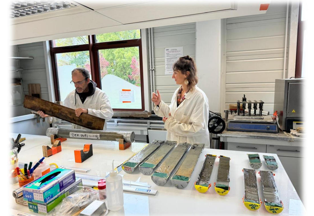
Sedimentology room - EDYTEM

The sediment cores were opened using a dedicated core-splitting bench (EDYTEM) to perform non-destructive analyses such as high-resolution image, hyperspectral analysis (IR and near-IR) and relative measurement of the mineral chemical element content using an Avaatech X-ray fluorescence core scanner (ED-XRF).