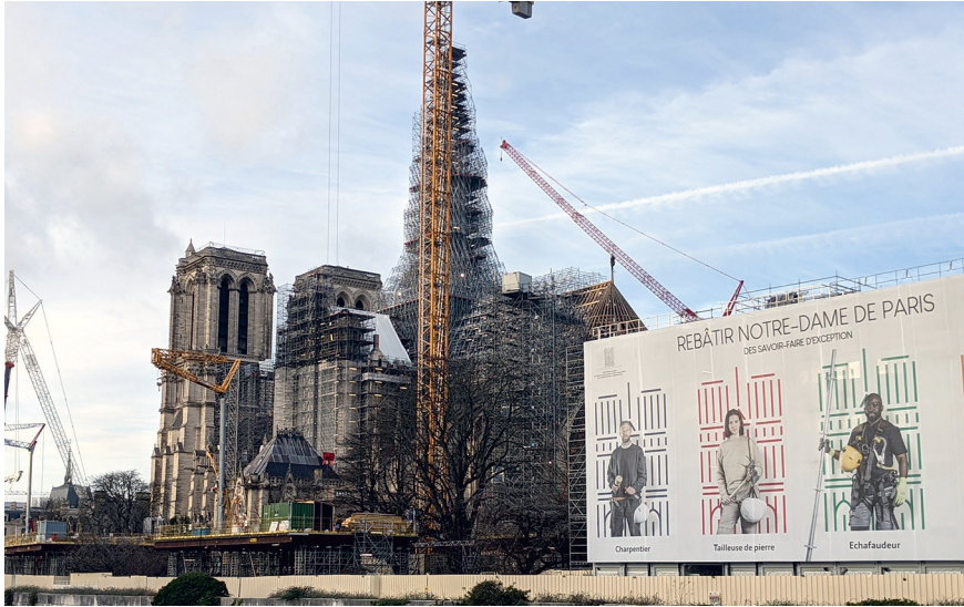
Figure 5. View from Stop 4 of the cathedral's new spire, surrounded by scaffoldings, follow the collapse of the previous spire that burnt during the fire of April 2019.