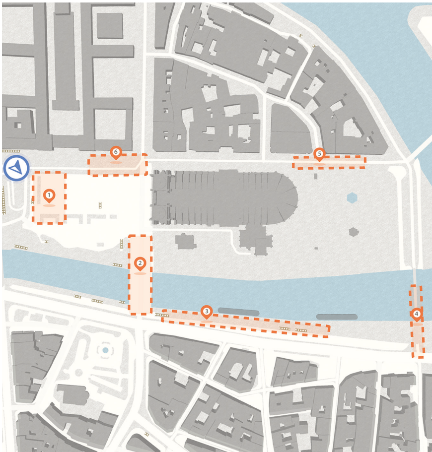
Figure 4. Overhead map of the proposed visit route around Notre-Dame including the visitor's position (blue arrow) and the six stops (orange dashed square-boxes). List of stops: Parvis (1), Pont-au-Double (2), Quai Montebello (3), Quai Montebello (4), Pont de l'Archevêché (5), and Return to Parvis (6).

cathedral using both senses. Therefore, the stop locations were chosen as they enable visitors to initially observe the cathedral and then engage in an auditory experience related to what they are observing (stop locations are shown in Fig. 4 and topics addressed in the associated audio pieces are summarized in Table 1). For example, the location of Stop 4 offers an unobstructed view on the cathedral's spire that collapsed during the fire of April 2019, as seen in Fig. 5, opening the way for the Evening of April 15, 2019 audio piece narrating the sequence of events that led to that dramatic event. In addition to enriching the visitor experience, the view offered by these stops makes the presentation of the visit content more didactic, thereby enhancing learning potential.