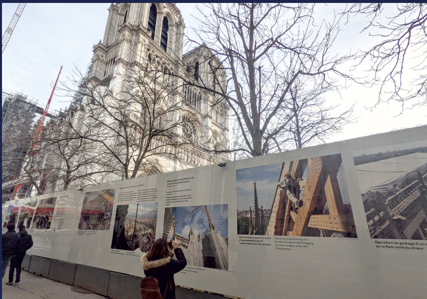
Figure 2. View of the mediation panels about the fire and the restoration work installed on the exterior of the restoration site's enclosure.