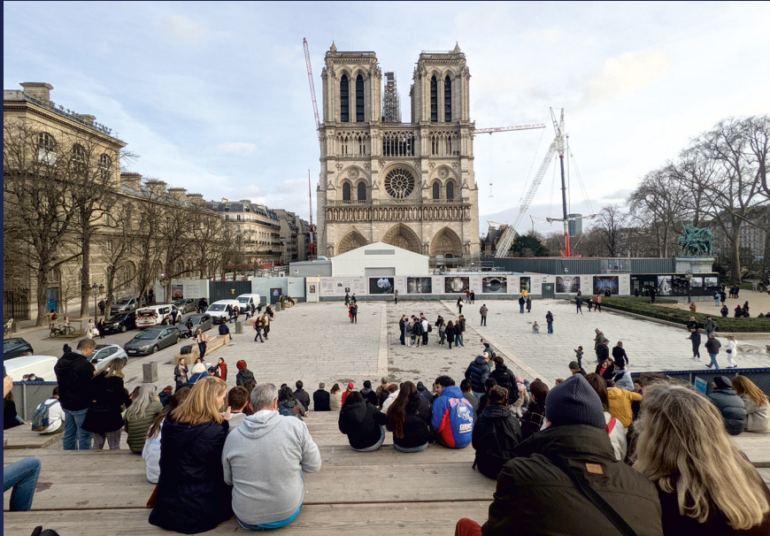
Figure 1. View of Notre-Dame's main façade as seen from the tiered seating installed on the opposite side of the parvis (photograph by the authors, January 2024).