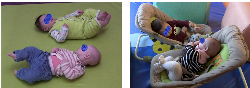
Fig. 1. Positioning in dyadic situations, on the playmat and in the baby bouncers.

First, all the video recordings were coded by the main observer (FC) based on the final repertoire. Second, 20 % of the data (i.e., 8 recordings, including 2 for each situation) were coded by another researcher in order to calculate Cohen's Kappa coefficients for each variable. Coefficients were found to vary from 0.73 for general body movements to 0.96 for vocalisations. Discrepancies between the