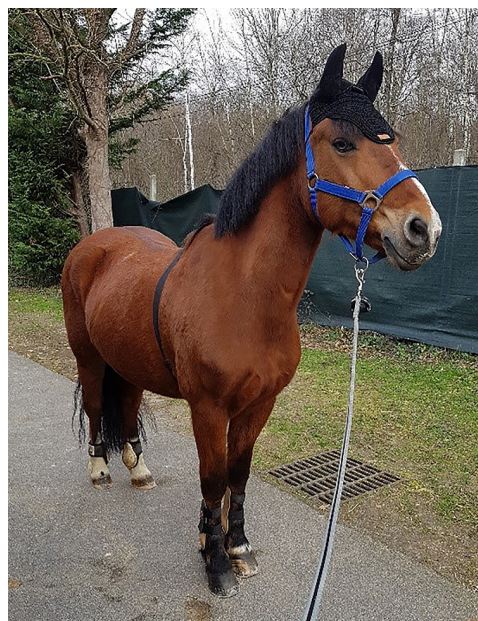
Figure 1: Photograph of the audio cap placed on a halter.

It is possible that repeated exposures to the same stressful situation may induce habituation to this type of stress per se , thus gradually diminishing its stressful nature. To limit this risk, the stimuli's position and order of appearance were modified from one exposure to another, and different audio stimuli were selected each time. The aim was to prevent the horses from becoming accustomed to the stressful situation, which would prevent the detection of a potential habituation to the music. In addition, for a given stressor type (e.g., throwing a ball), the intensity was gradually increased after each exposure (first exposure: ball thrown 5m in front of the horse, last exposure: ball thrown 3m behind the horse, Table 1 . For an example, see Supplementary Material 1 .