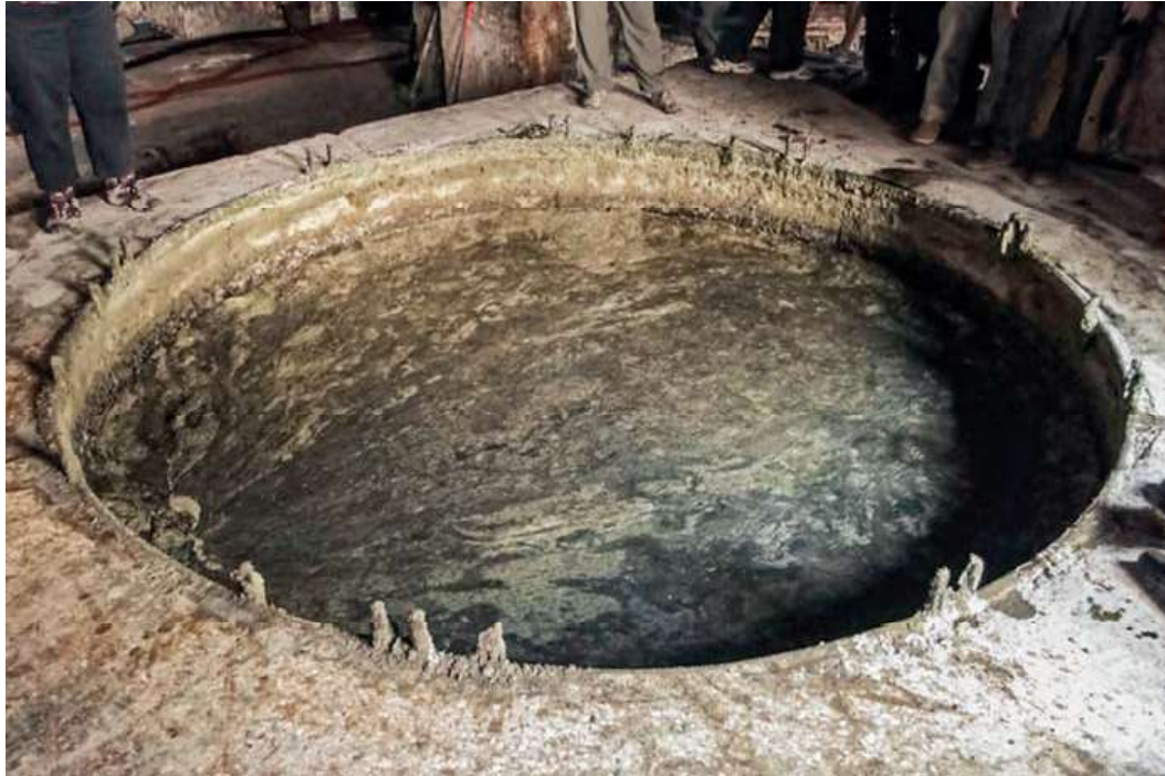
Fig. 1. Vat of Aleppo soap at the Al-Jebeili factory, Aleppo, Syria, 2010. Masses of saponified fat in process of formation – maybe the “piece of brine” floating on the surface, are visible in the foreground.