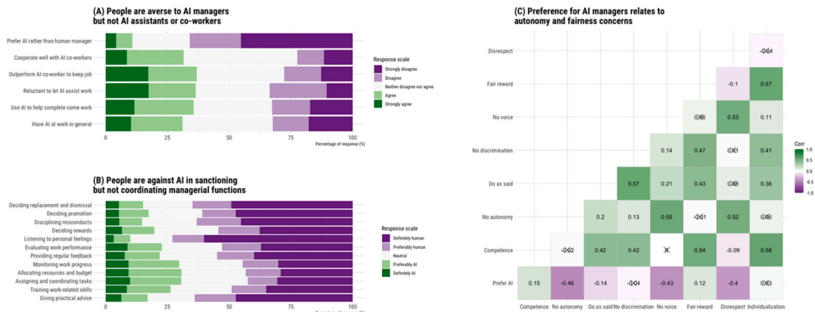
Fig. 2. Summary of the representative-sample survey on AI management (N = 488).

Mohlmann and Zalmanson, 2018; Newman et al., 2020).