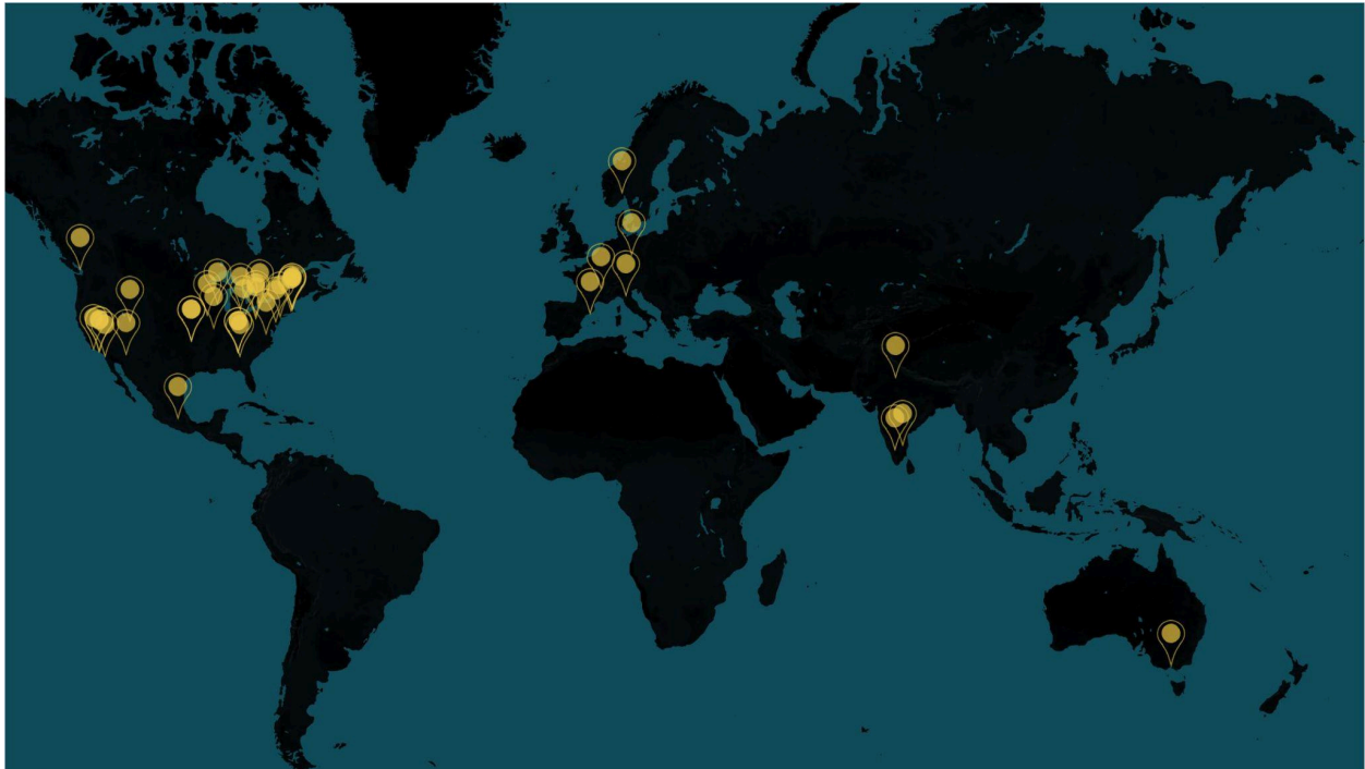
Figure 2: Geographical distribution of the current ENIGMA-Meditation membership (as of April 2024).

The currently available datasets include multimodal MRI neuroimaging data already or imminently acquired pre-to-post interventions (resting-state fMRI, structural MRI) and during meditation-related tasks (task-fMRI) associated with a variety of samples (healthy individuals, individuals with clinical conditions, novice meditator and expert meditator), contemplative practices (mindfulness, focused attention, compassion / loving-kindness, Vipassana, Yoga, Zen) and MIs (e.g., MBSR, MBCT, MORE, retreats). A number of resting-state and task-based EEG datasets have also been identified for future inclusion. Most of the datasets also include standardized self-report measurements such as Five Facet Mindfulness Questionnaire (FFMQ), Mindful Attention Awareness Scale (MAAS), State Mindfulness Scale (SMS), Cognitive Affective Mindfulness Scale (CAMS), etc. Supplementary Table 1 lists neuroimaging datasets currently available to ENIGMA-Meditation. Overall, ENIGMA-Meditation currently has access to MRI data from >200 expert meditators, >1300 healthy beginner-level individuals, and >600 patients with different psychiatric disorders, including MDD, PTSD, dissociation, social anxiety and early-life adversity.