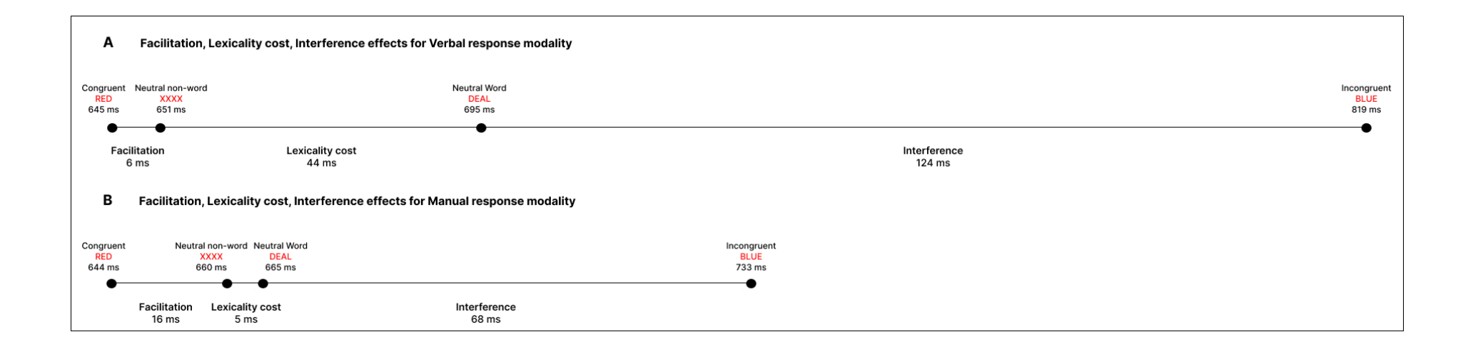
Figure 1. Contribution of facilitation, lexicality cost and interference effects to the overall Stroop/congruency effect.

Note. Original figure based on data from Augustinova et al. (2019) reported with Verbal (Panel A) and Manual (Panel B) response modality.