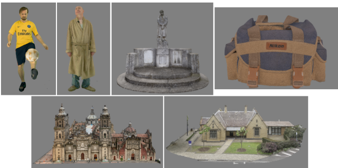
Fig. 3. Screenshots of the selected PC references, rendered with no shading.