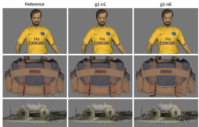
Fig. 4. Examples from each semantic category of a reference point cloud and two highly distorted versions ( g1-n1 and g1-nE ) rendered in Unity with a directional light. The surface artifacts of estimated normals ( nE ) are revealed by the virtual lighting.

the most compressed geometry with the most compressed normals ( g1-n1 ), and with estimated normals ( g1-nE ).