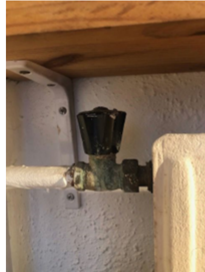
Image 5: Building façade (right). Oxidized heating taps (left), a source of tenant frustration and dissatisfaction © SAPHIR, 2023.