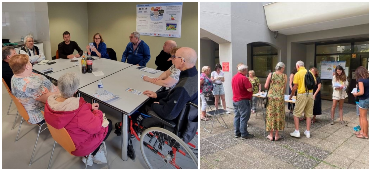
Image 3: educational café (left), focus group (right)

During the project’s second phase, resident trajectories, housing and neighborhood practices, as well as health-related issues and perceptions were explored with tenants. Living surveys were also conducted, aiming to map housing layouts to better understand spatial use, room versatility, occupant density and so on. The results of these interviews and surveys are compiled into sheets that describe “places and issues,” which can be windows, elevators, balconies, stairs, heat and common areas. These “places and issues,” which can be windows, elevators, balconies, stairs, heat and common areas. These “places and issues,” are often the topic of anecdotes, rumors and specific meanings which are outlined in these sheets. They are also subject to resident “trade-offs,” especially when the space becomes “ contradictoire ,” to quote Henri Lefebvre in Busquet (2012). Based on our research, examples include opening a window to air out and in turn letting in pollution; blocking the vents to retain heat; heating the apartment to dry laundry, etc. Through the stories of the tenants we interviewed, both individually and collectively, we are able to use the notion of health to address the issue of housing quality.