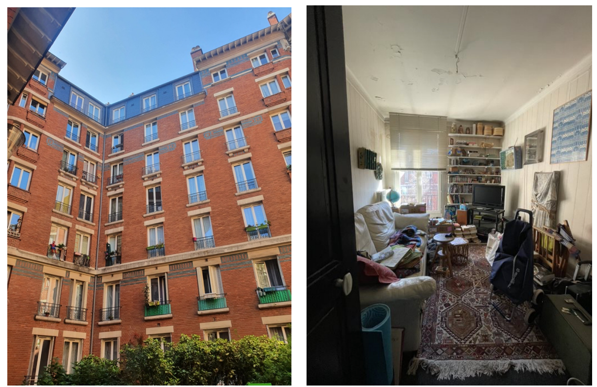
Image 4: building façade (left). Use of rugs for soundproofing (right)

people, with a high proportion of elderly residents. The red-brick façade prevents exterior renovations that would alter the architecture; the narrow interior makes interior renovations difficult to imagine (Wilson and Fijalkow 2024). It is also worth noting that the social landlords of these buildings only receive state subsidies for exterior energy renovation.