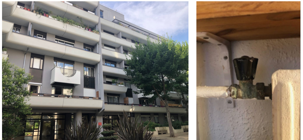
Image 5: Building façade (right). Oxidized heating taps (left), a source of tenant frustration and dissatisfaction \bigcirc SAPHIR, 2023.

3. This intergenerational and accessible housing residence, scheduled for completion in 2023, is located in the south-western suburbs of Paris (Yvelines department). The building benefits from a "health" label, concentrating on social support for residents. The developer and social manager brings together three complementary businesses: insurance and retirement, care and assistance, and housing. Its three buildings constitute social rental housing, intermediary rental housing and home ownership. These "accessible" housing units target the elderly and disabled (14 of the 95 units are reserved for tenants aged over 65 and/or disabled). An outreach manager accompanies these populations, operating out of the common room (40 m2), which is a space offered to residents by the landlord. The buildings were constructed according to the latest thermal and noise standards, featuring many home automation features, such as in the window shutters, a double thermodynamic flow system (CMV), doors with security codes and individual heating thermostats. Some of the homes have balconies, in addition to the outdoor communal areas that open onto the city.