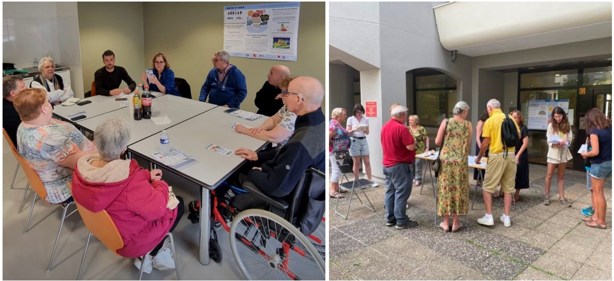
Image 3: educational café (left), focus group (right)

During the project's second phase, resident trajectories, housing and neighborhood practices, as well as health-related issues and perceptions were explored with tenants. Living surveys were also conducted, aiming to map housing layouts to better understand spatial use, room versatility, occupant density and so on. The results of these interviews and surveys are compiled into sheets that describe "places and issues," which can be windows, elevators, balconies, stairs, heat and common areas. These "places and issues" are often the topic of anecdotes, rumors and specific meanings which are outlined in these sheets. They are also subject to resident "trade-offs," especially when the space becomes " contradictoire ," to quote Henri Lefebvre in Busquet (2012). Based on our research, examples include opening a window to air out and in turn letting in pollution; blocking the vents to retain heat; heating the apartment to dry laundry, etc. Through the stories of the tenants we interviewed, both individually and collectively, we are able to use the notion of health to address the issue of housing quality.