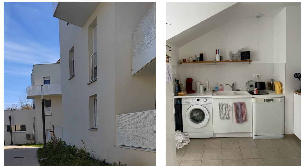
Image 6: Building façade (left). Kitchen radiators (right) are a source of tenant frustration and dissatisfaction with its loud CMV © SAPHIR, 2024.

In all three cases, and from a methodological point of view, the "educational cafés", individual interviews and focus groups enabled us to identify "places and issues", that reflect, "critical situations". The latter is identified as the result of contradictory imperatives concerning energy consumption, bill reduction, soundproofing and the quest for individual and collective well-being. In such a context, "residential stress" is observed, representing the reaction and expression of residents regarding their basic needs and difficulties in finding a solution to "critical situations". As a result, residents lose the ability to make their housing a meaningful choice, to feel in control over their environment, to adapt it in the long term, and to maintain their ability to respond to the demands of housing managers (Fijalkow & Wilson, 2023 b). To shed light on such "residential stress," we drew on residents' narratives, which reveal different levels of housing and health literacy.