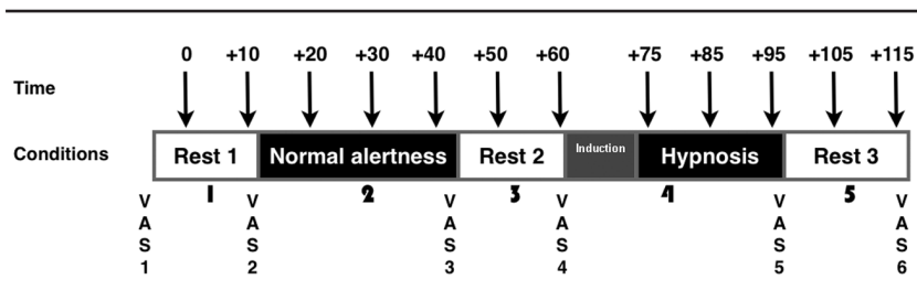
Figure 1. The experimental PET acquisition protocol was constituted of five sequential conditions: 3 resting periods of 20 min each, alternated with the analgesic suggestion periods of 30 min, first in normal alertness state, and second in hypnotic state, preceded by its induction period of 15 min. VAS were measured before and after each condition. Vertical arrows indicate the times of the 12 PET data acquisitions.

As described in Figure 1, the protocol was applied to Groups A and B in five sequential conditions: three resting conditions of 20 minutes each alternating with the analgesic suggestions of 30 minutes each, (a) in normal alertness state and (b) in hypnotic state. Hypnotic state was reached following a 15-minute hypnotic induction (invitation to enter a hypnotic state). The hypnotist and the patient were wearing headphones and a microphone to communicate. Before each acquisition of the hypnotic condition, the hypnotist asked the patient if he was experiencing hypnosis. Moreover, an oculography was performed to observe any roving eye movements, known to be