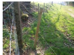
Figure 1: Correct fences 2 - external fence at least 1.3 m high + internal fencing with several superimposed electric wires.