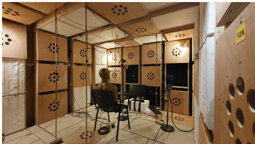
Figure 1: Room for IS and LF sound restitution

The system is composed of 32 subwoofers Electrovoice ELX 118 of 18" modified in enclosed loudspeakers (for frequencies below 30 Hz), 40 bass loudspeakers Beyma 10G40 of 10" mounted in a homemade enclosure (for frequencies between 30 Hz and 3 kHz). This set of loudspeakers was mounted in an enclosed, insulated and leakproof 23.8 m 3 (effective volume, 40 m 3 empty) concrete cabin (see Figure 1 ). The high cut-off frequency of the system is high enough to reproduce wind turbine noise spectra which decrease abruptly above 2 kHz (see Figure 2 ). The 32 subwoofers are driven by 8 Lab Gruppen IPD 1200 2-channel amplifiers (for a total of 16 independent channels). The 40 bass loudspeakers are driven by 10 QSC PLX 2502 2-channel amplifiers (for a total of 20 independent channels). Each channel drives a pair of loudspeakers. A PCI express RME HDSPe MADI card connected to a RME ADI 648 multichannel interface permits to control, with an ADAT protocol, a ferrofissh A16 MKII AD/DA which converts the digital signal into an analog signal (and vice-versa) sent to the Lab Gruppen amplifiers and a RME M-32 DA AD/DA which converts the digital signal into an analog signal (and vice-versa) sent to the QSC amplifiers. An ANTELOPE OCX HD clock synchronizes all this equipment.