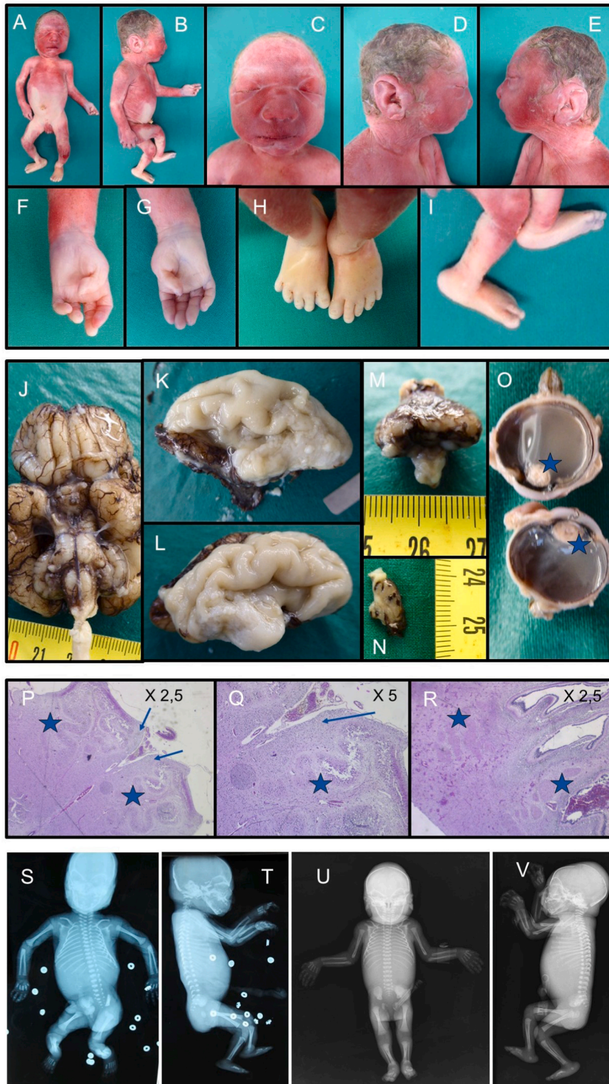
Fig. 2. Post-abortion findings. Fetal examination (fetus 1 A-I) at 32 WG revealed sloping forehead (B-D-E), hypertelorism (C), large dysplastic ears (D,E), wide nose (C), micrognathia (D,E), adducted thumbs (F,G), rocker bottom feet (I), macroscopic brain anomalies with spindly pyramids (J), simplified gyration with an open sylvian fissure (K,L), cerebellar hemispheres hypoplasia (M) and vermis (N), and bilateral cataract (O: asterisks). Neuropathological examination (HES staining) shows major hypoplasia of the pyramids (arrows) and the bulbar olives (asterisks) (P,Q) with fragmented dentate nuclei of the cerebellum (R: asterisks). Post-abortion skeletal radiographs show a delayed bone maturation in fetus 1 at 32 WG, with absence of talar, calcaneal and pubic ossification points (S,T) and in fetus 2 at 31 WG, with absence of talar calcification (U,V).